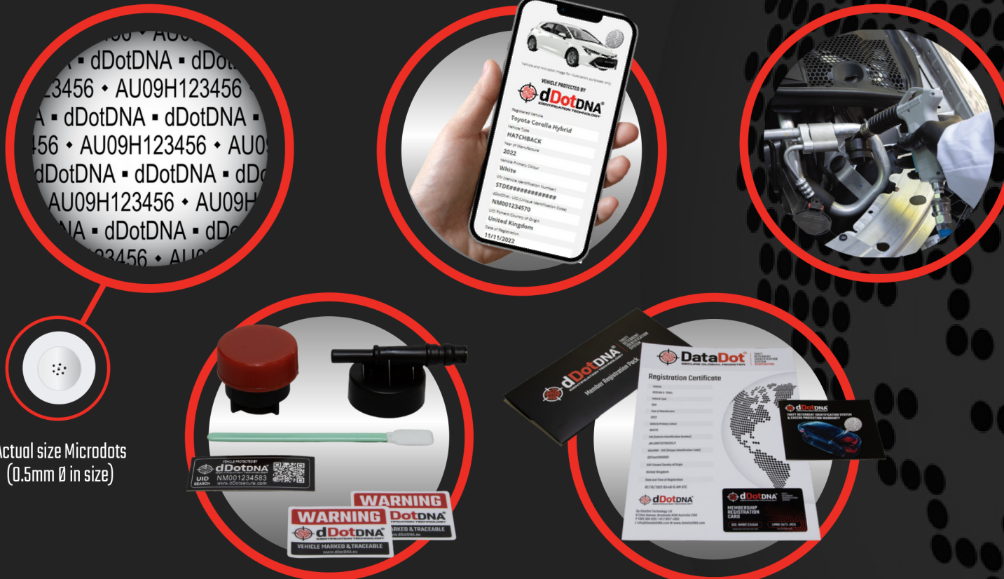
Actual size Microdots (0.5mm Ø in size)

The new TDIS provides a substantial product enhancement offering, which includes our new proprietary spray technology and DataDot registration database (for international mkts) with customisable OEM branding and smart QR code registration authentication display.