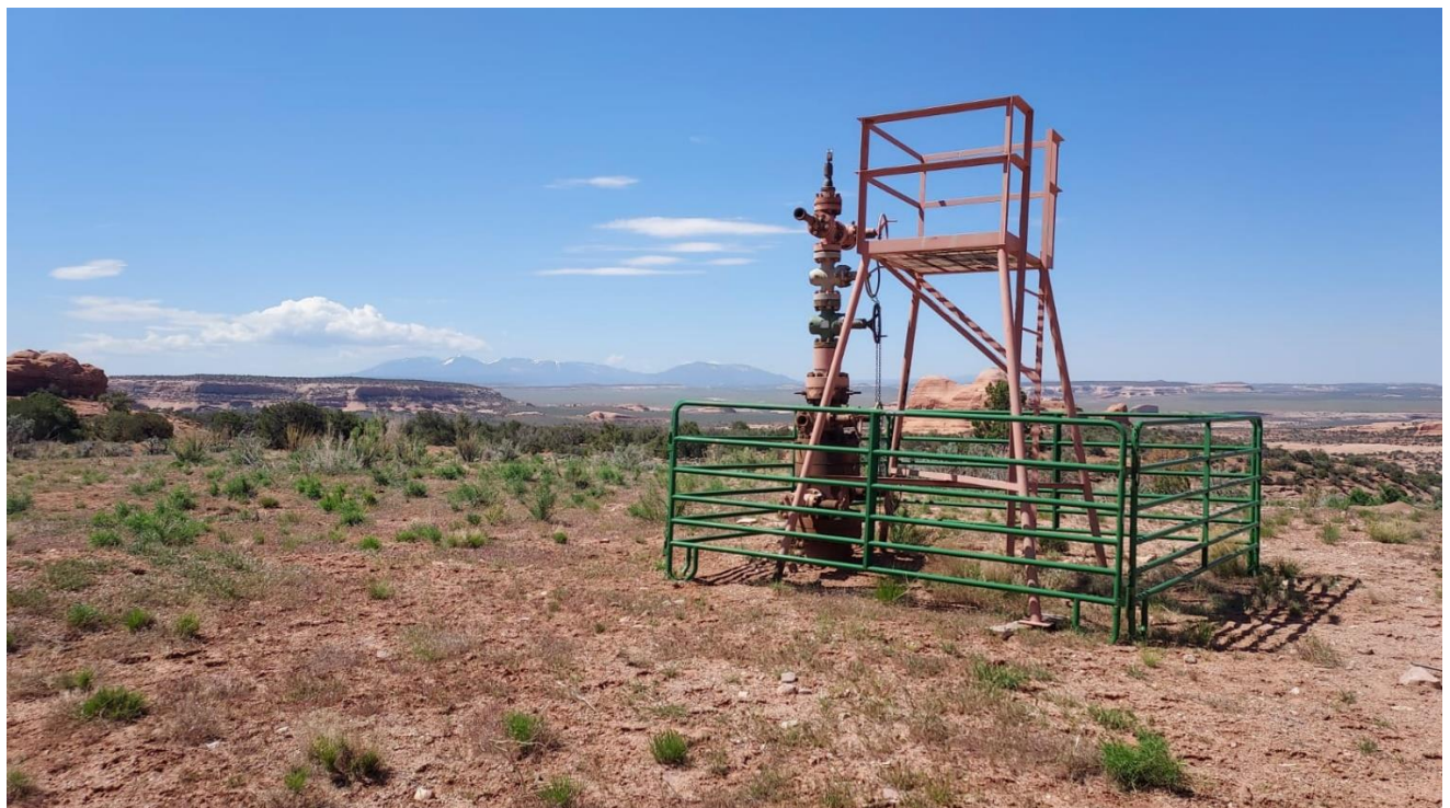
Figure 1 - Shut-in well at the Utah Lithium Project