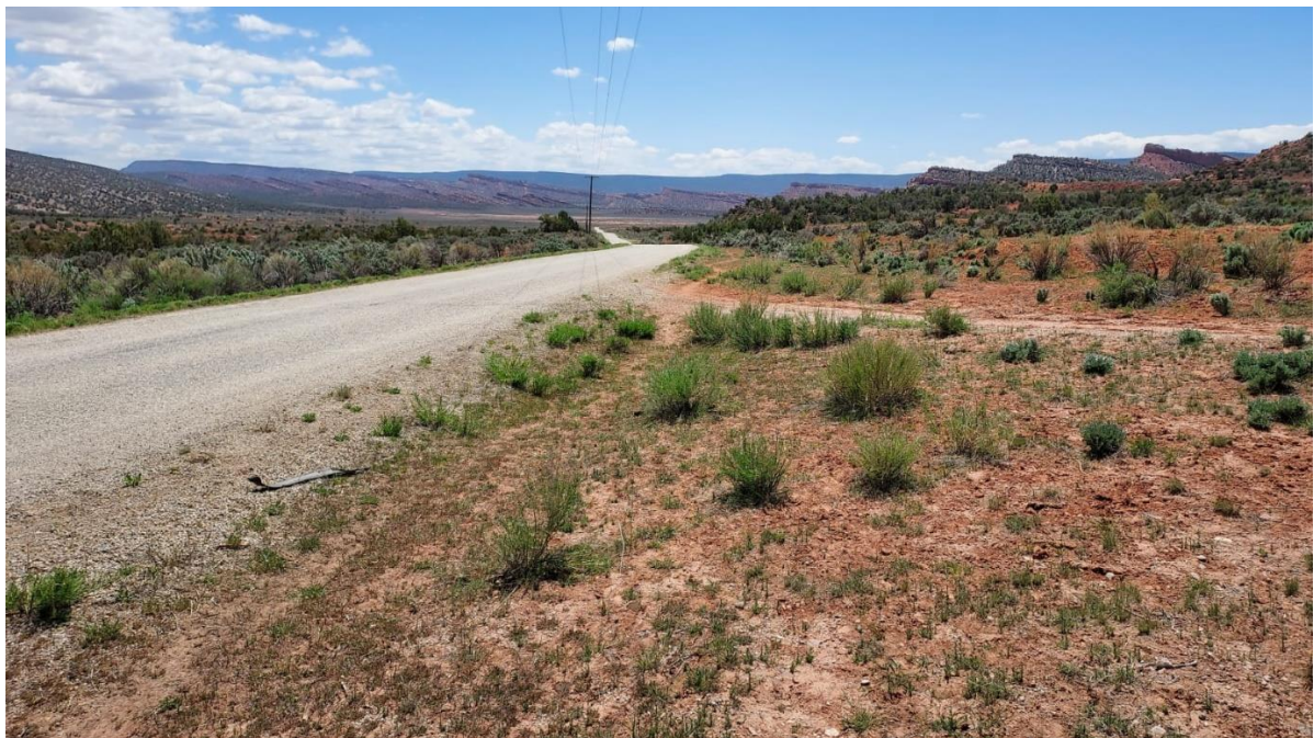
Figure 2 – Access road through the middle of the Utah Lithium Project. Note power availability

A minimum of six wells were identified as high priority candidates for lithium sampling re-entry.