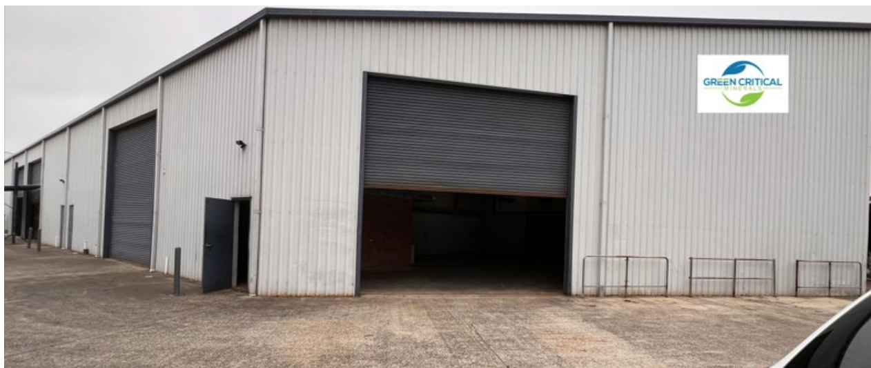
Figure 1 Green Critical Minerals VHD Technology Industrial Facility.

This progress represents a significant leap forward in GCM's commitment to establishing a sustainable and high-value graphite production pipeline, creating opportunities to address market demands in advanced technology and renewable energy sectors.