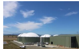
YVW Bioenergy Plant