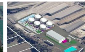
BKW1 Bioenergy Plant