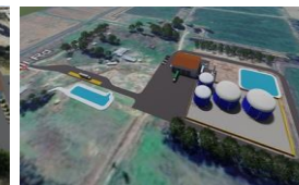
VIC1 Bioenergy Plant