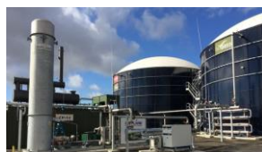
Jandakot Bioenergy Plant