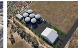
QLD1 Bioenergy Plant