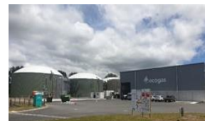
Ecogas Bioenergy Plant