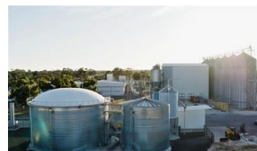
Blue Lake Milling Bioenergy Plant