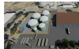
SA1 Bioenergy Plant