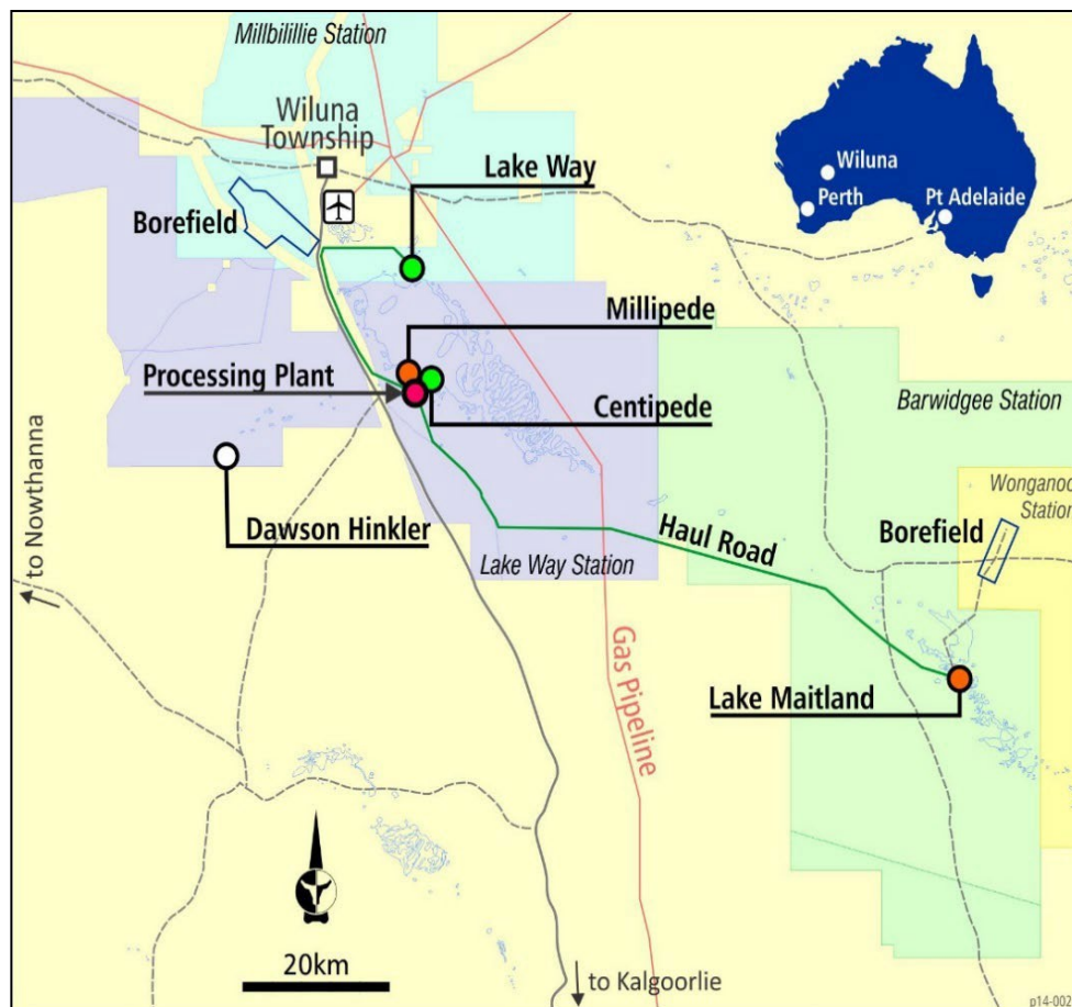
Figure 1: Location of the Wiluna Uranium Project

The Company's expenditure on evaluation and exploration activities detailed above for the quarter totalled $1,028,000.