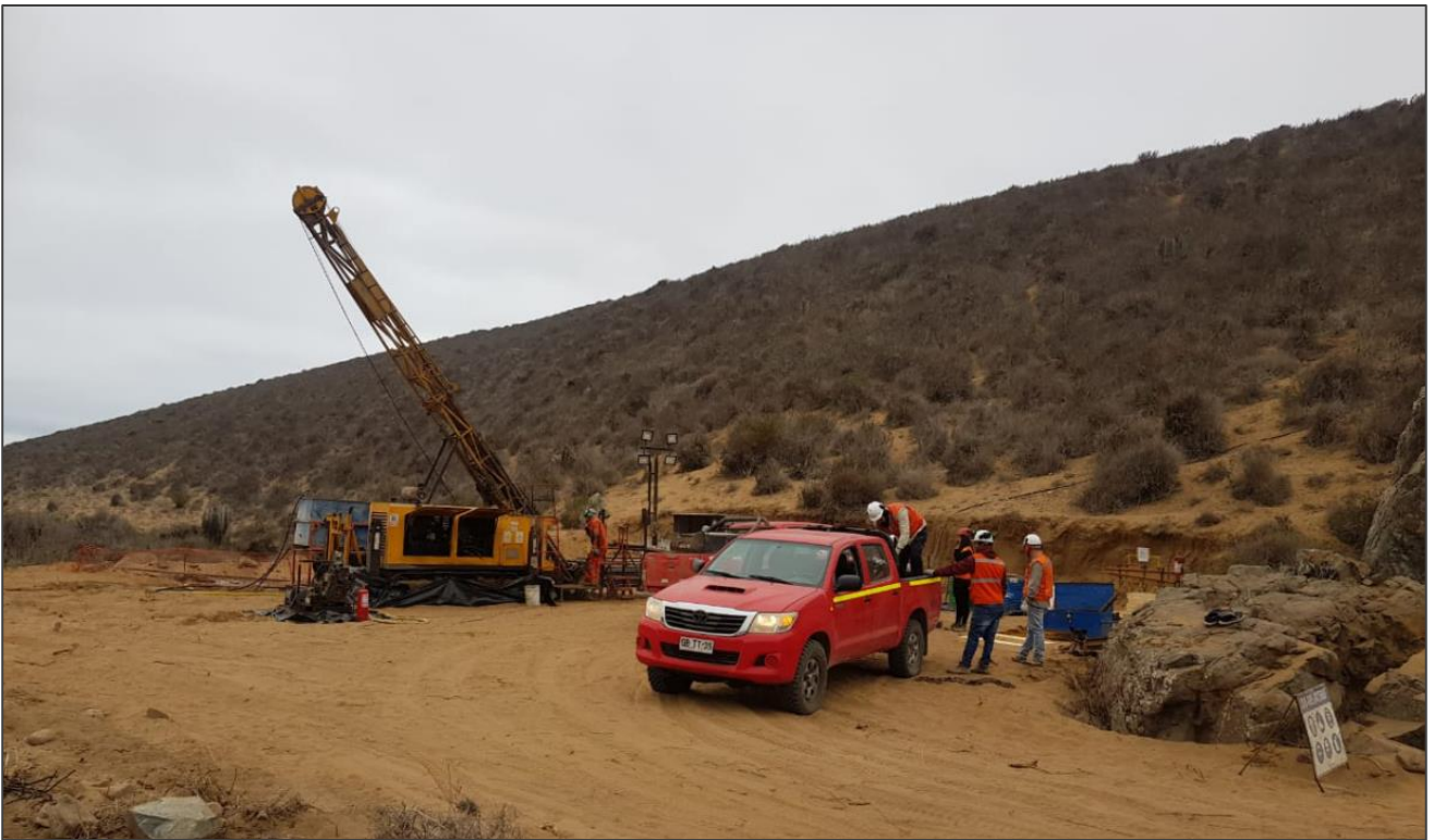
Figure 6– drilling of diamond holes YB040, YB041 and YB042 from the base of the ravine