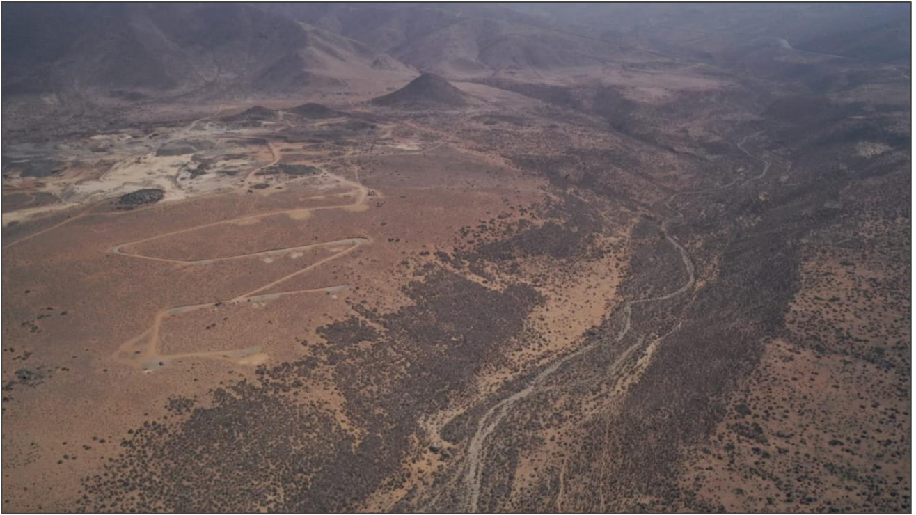
Figure 5 – 2029/2020 diamond drilling area