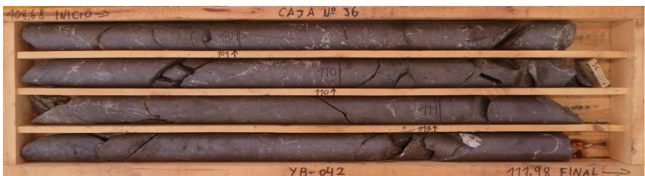
Figure 4 - Core tray 36 from diamond drill hole YB042 showing high grade magnetite mineralisation – interval 108.68m to 111.98m shown