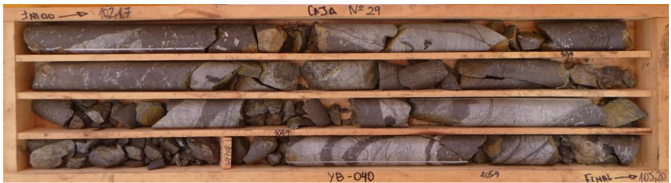
Figure 2 - Core tray 29 from diamond drill hole YB040 showing high grade magnetite mineralisation – interval 102.17m to 105.2m shown