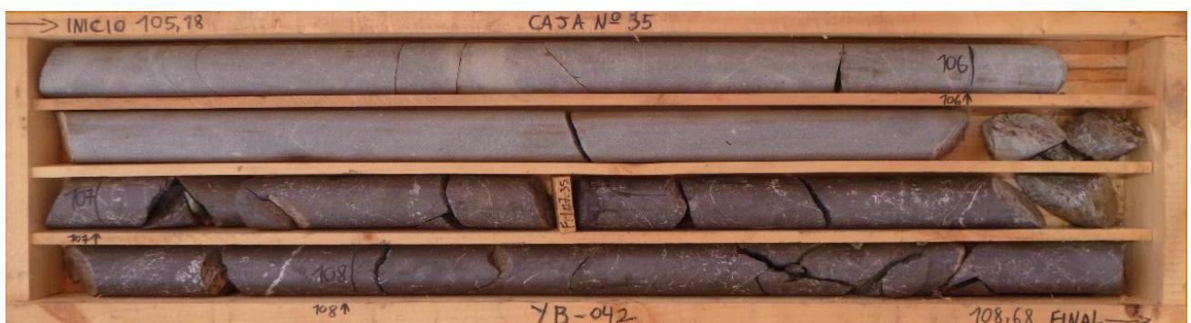
Figure 3 - Core tray 35 from diamond drill hole YB042 showing high grade magnetite mineralisation – interval 105.18m to 108.68m shown