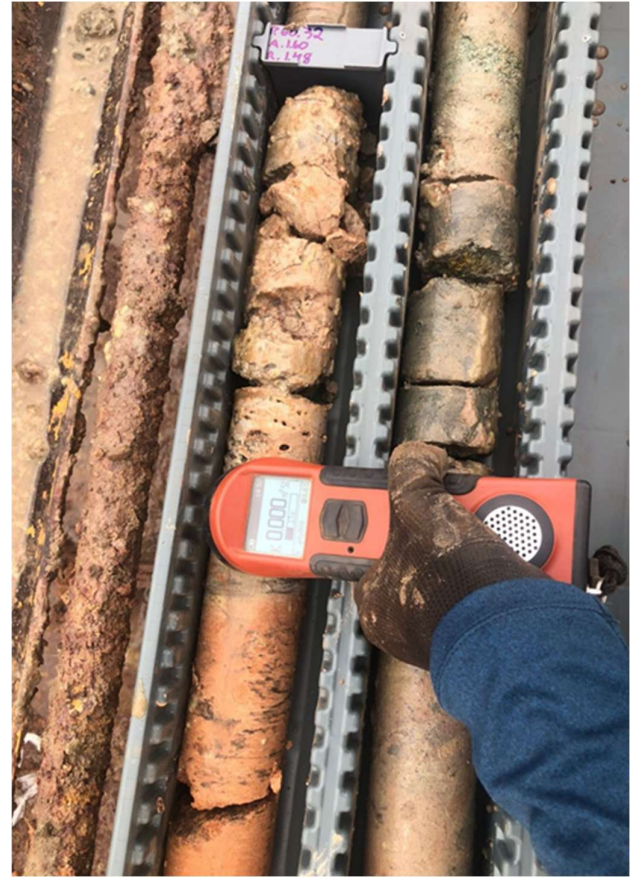
Figure 2: Magnetic susceptibility test on drill cores.

The ongoing drilling at Coda North has intersected significant mineralised zones within the Patos Formation, part of the Cretaceous Mata da Corda Group. These intersections suggest a robust and continuous mineralised system, with REE concentrations that underscore the high-grade potential of the area. The discovery is particularly noteworthy as it not only validates the geological model but also points to a much larger mineralised footprint than initially anticipated. This expands the scope of Enova's exploration strategy and strengthens the potential for a substantial increase in resource estimates.