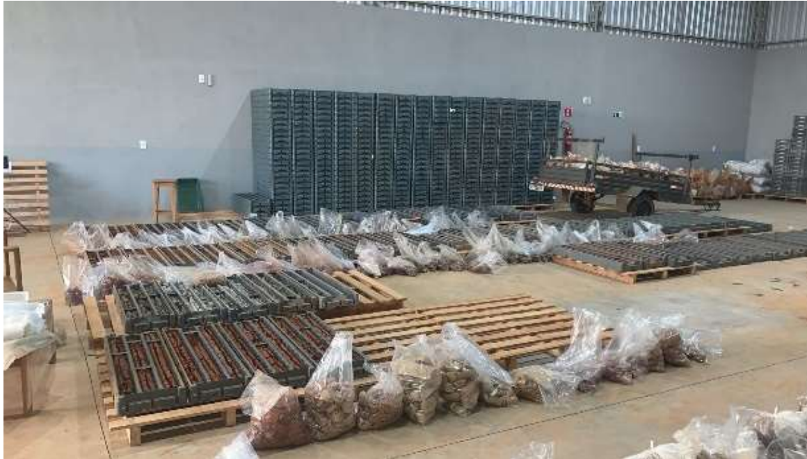
Figure 5: RC and Diamond drill sample batches are stored in the core shade