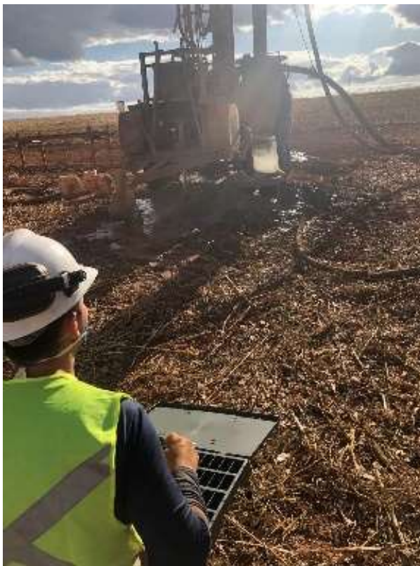
Figure 6: Enova professional geologist entering data at drill site