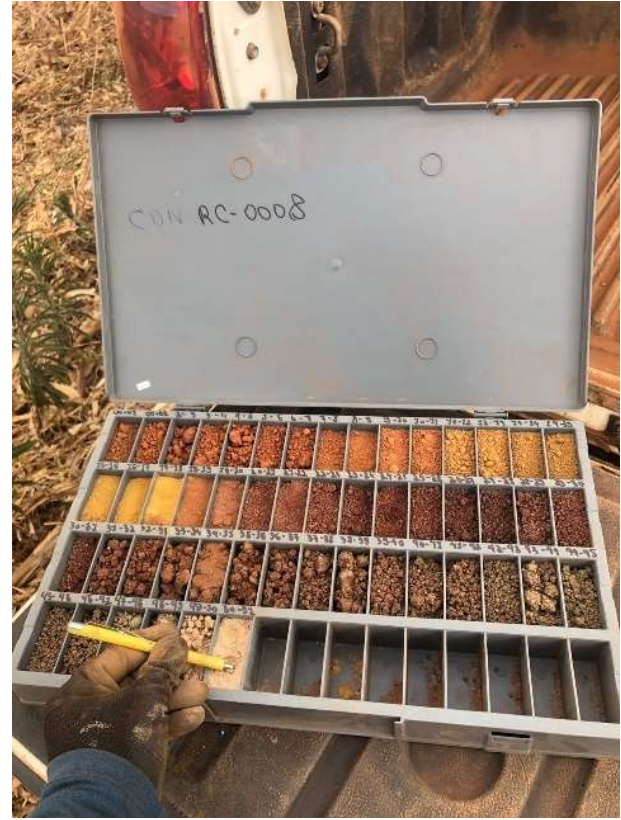
Figure 4: RC drilling chip tray of CDN RC 008

As Enova advances its exploration efforts, these high-grade discoveries at CODA North will play a pivotal role in shaping the company's future development plans. The consistent intersection of REE mineralisation highlights the project's viability and positions it as a key asset in the company's portfolio. With further assay results expected from the ongoing drilling program, Enova is committed to maximising the value of CODA North, paving the way for resource expansion and long-term economic extraction opportunities.