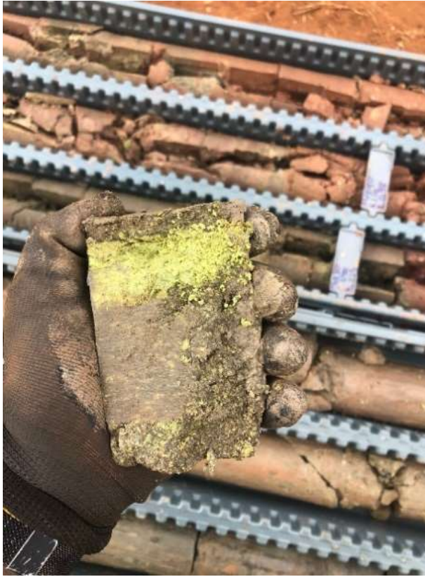
Figure 3: Yellow saprolite with Patos formation