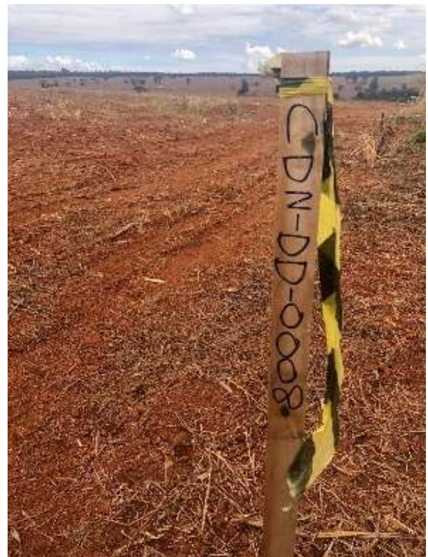
Figure 7: The drill holes have been pegged