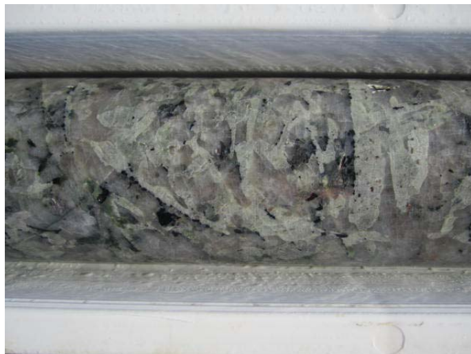
Figure 4: Intense medium-grained spodumene mineralisation in pegmatite from around 177m down hole, below the current resource. Core is HQ diameter (63.5mm).