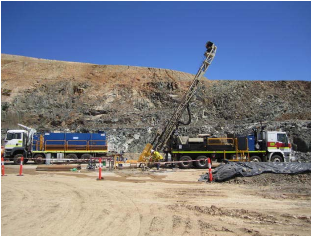
Figure 1: Diamond drilling in the Dowling Pit, February 2016

Drilling has commenced and is continuing on a double shift basis. The hole is nominally designed to 600m depth, drilled at an azimuth of 200 0 , inclined at 60 0 and is considered important to test various flat-lying stratigraphic horizons (below the depths tested in 2008 of approximately ~200mbs) indicated by reflectors in seismic work conducted during 2010-11.