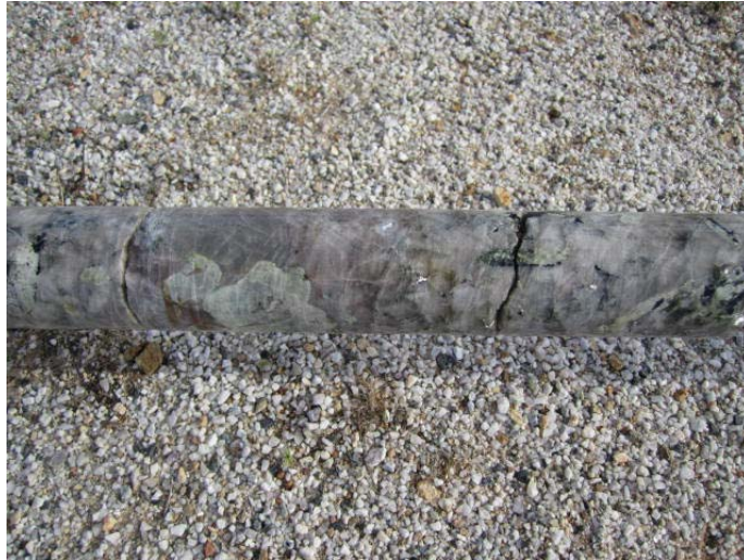
Figure 3: Coarse-grained light-green spodumene crystals in pegmatite from approximately 167m down hole, below the current resource. Core is HQ diameter (63.5mm).