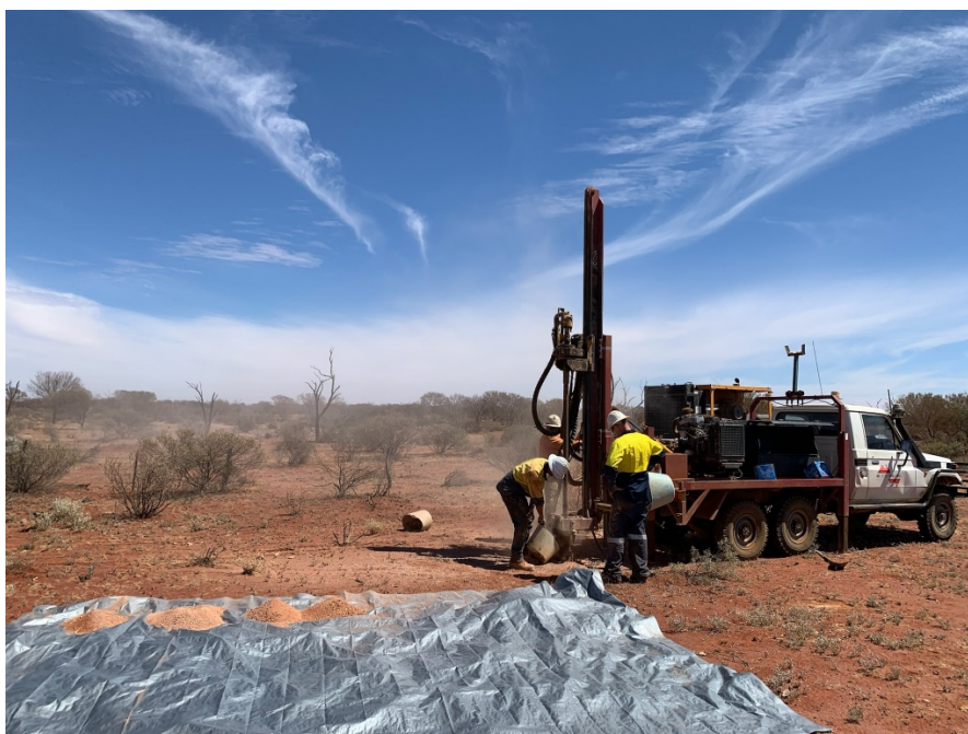
RAB Drilling Operations at Comet Underway

Drilling is expected to be completed by the end of April. Follow-up bedrock drilling of gold mineralisation at Comet Gold Prospect and potentially other gold prospect areas located from the current regional RAB drilling program is scheduled to occur during the May-June period immediately following.