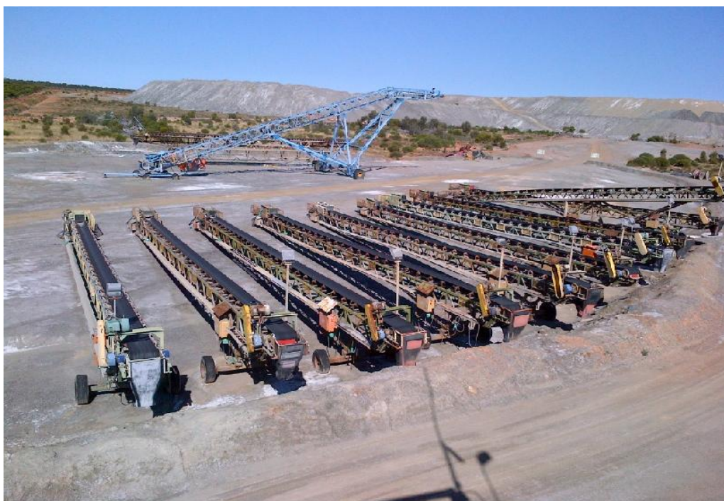
Figure 3: SIGM heap leach grasshopper conveyors and stacker

A preliminary engineering valuation study on the plant was completed by Como Engineers in June 2014 and included site visits to inspect the equipment, interview operating and maintenance personnel, collate all equipment list and drawings and inspect the carbon recovery circuit that is still in operation. A valuation and replacement cost review was then provided in addition to a condition report and a first pass estimate to relocate and refurbish the plant. Operating and maintenance data were also reviewed.