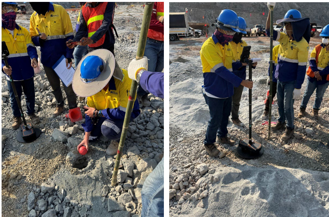
Chatree Mine Geologists conducting trial with Hexagon, February 2025