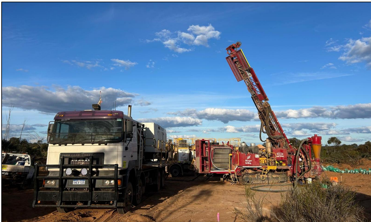
Figure 1: RC Drilling has commenced at the Talisker Prospect one of the IOCG targets to be tested

The program is fully funded by Minrex Resources Limited (“MinRex”) under the farmout option agreement executed (as per ASX announcement on 26 March 2025).