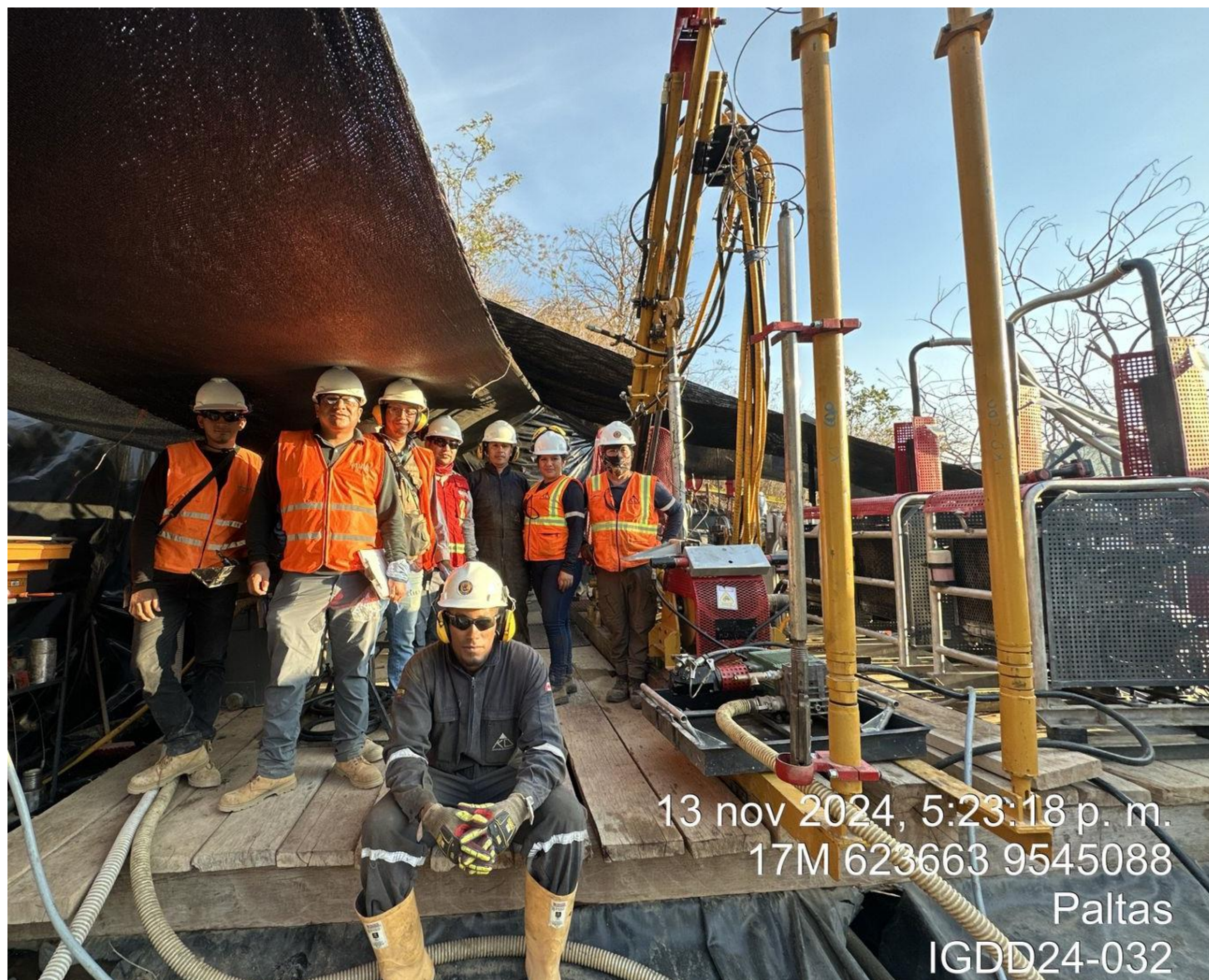
Plate 2: Diamond rig in operation at the Iguana prospect.