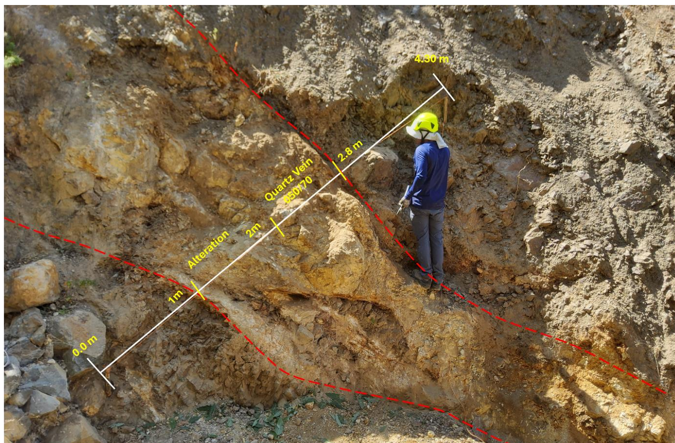
Plate 1: Channel sample IGC24-031 which returned a result of 1.8m @ 4.5 g/t Au, 10.6 g/t Ag from Iguana east, located approximately 100 metres from currently defined resources.