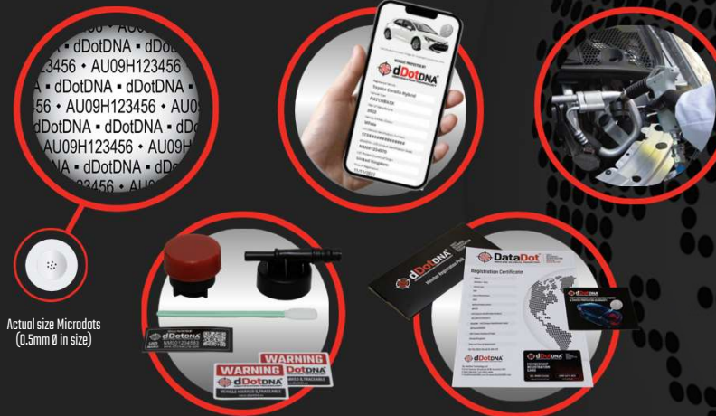
Actual size Microdots (0.5mm Ø in size)

Domestic and International Roll out of a suite of customisable & enhanced DataDotDNA® Theft Deterrent Identification System's (TDIS)