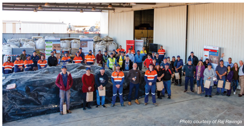
Figure 1 – Broken Hill Shareholder Open Day – Group Photo.

The COB processing technology exhibited at the Pilot Plant was explained to those in attendance as they toured throughout the facility. Interpretive signage helped to facilitate a deeper understanding of this new processing being deployed to extract cobalt and produce a battery-ready product.