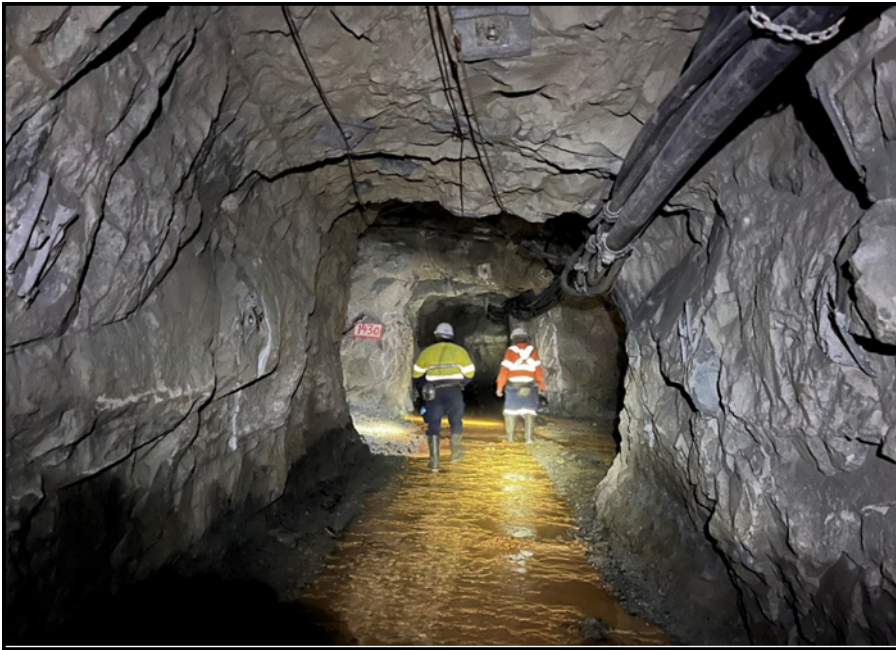
Figure 4: On-site workers in Amalgamated Adit (640 Level), main access for the Reward gold mine