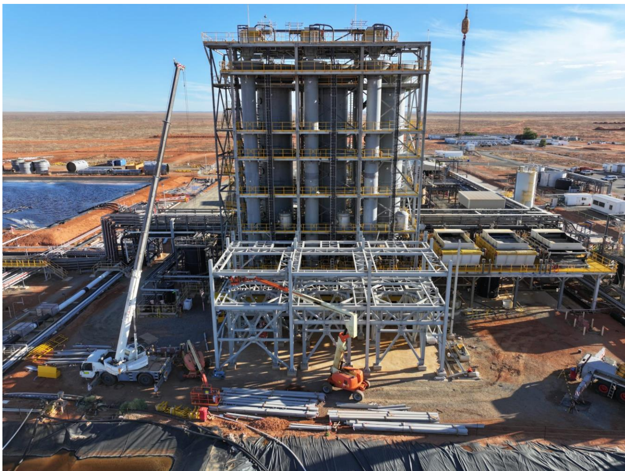
Figure 1: Steelwork foundations installed for construction of NIMCIX columns 4 to 6