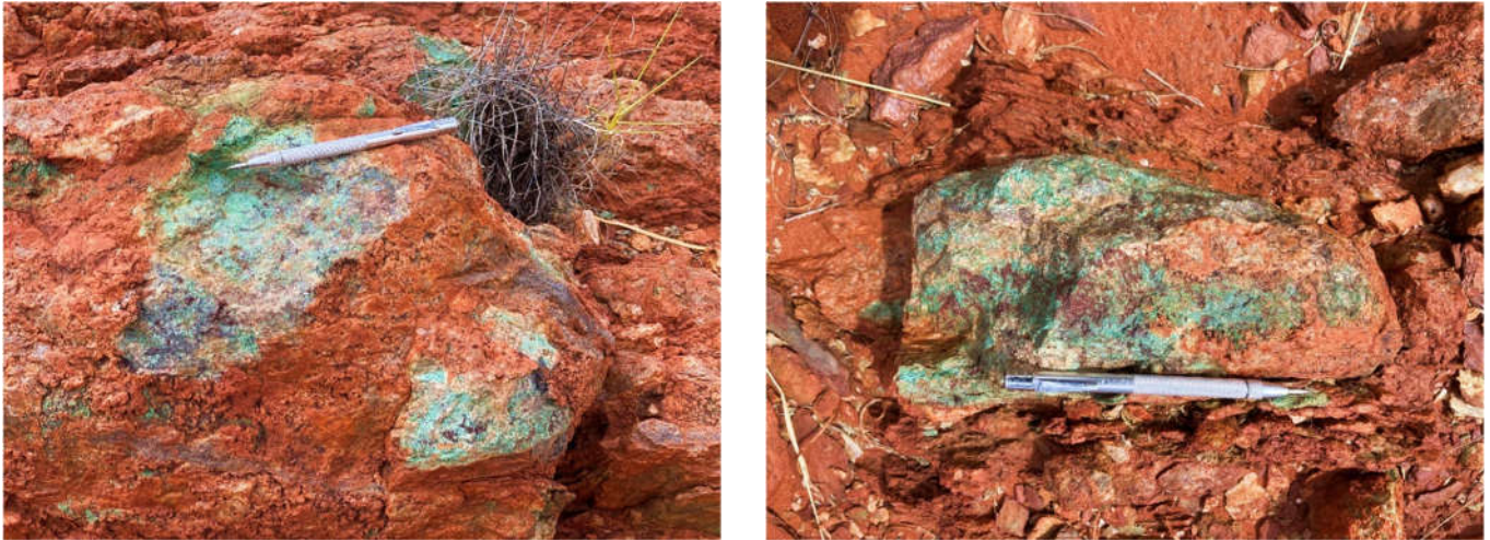
Figure 2 – Malachite (copper oxide) enriched & brecciated quartz veining from Pokali East area (KWRK001).