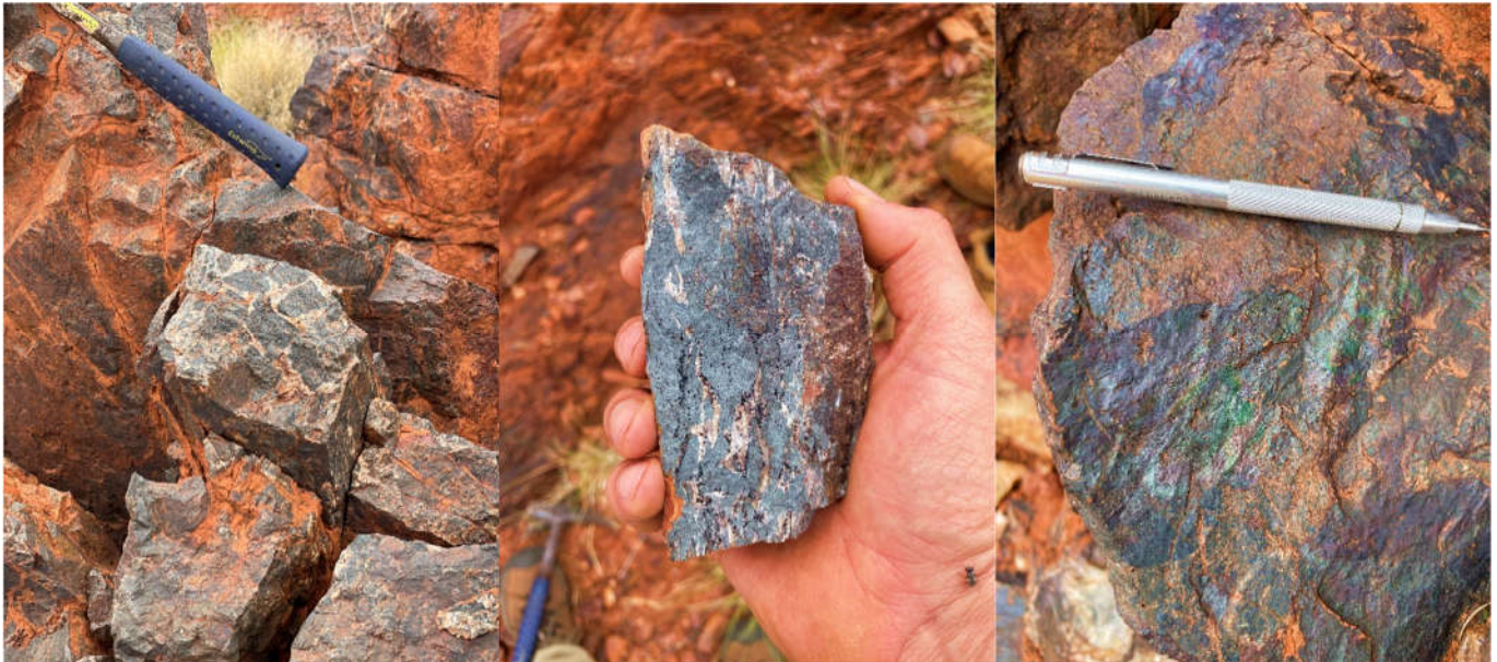
Figure 5 – Massive silica-hematite breccia located at the new ‘Jewel’ target (left, KWRK050; centre, KWRK045a; right, KWRK050).