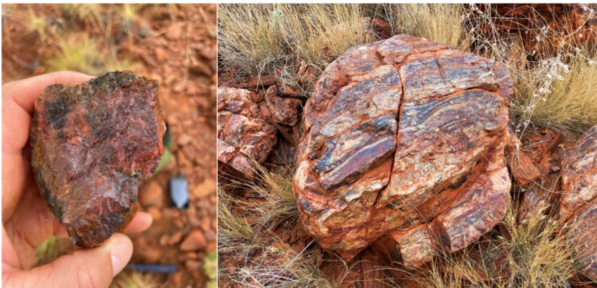
Figure 4 – Silica-hematite altered rock (left, KWRK028) & laminated silica-hematite-magnetite altered quartz vein/chert (right, KWRK039) located east of the new 'Jewel' target.