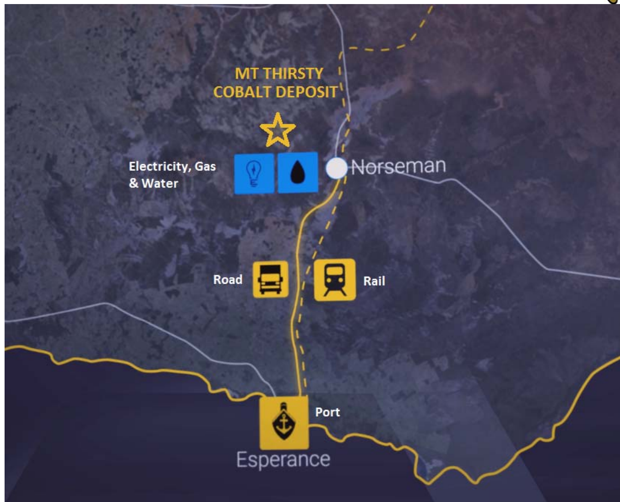
Figure 2: Location of Mt Thirsty Cobalt Project.