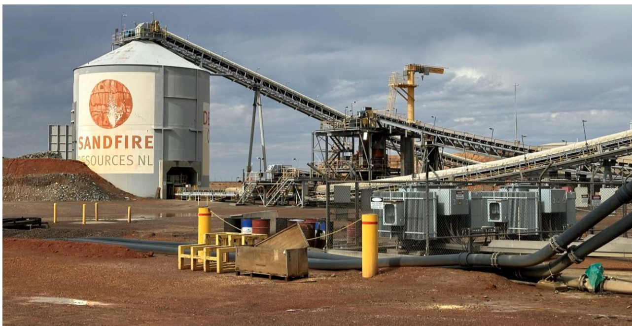
Figure 2: Image of the DeGrussa Processing Plant