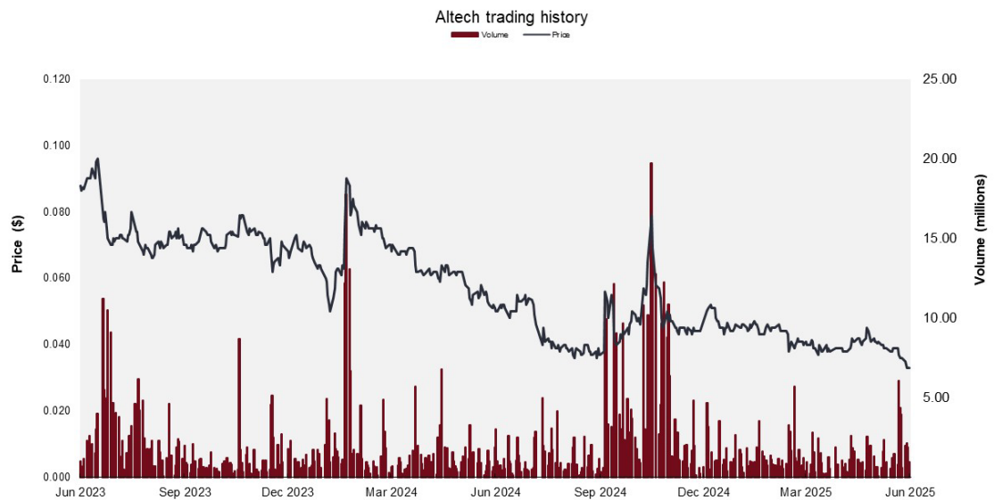
Figure 2. Altech ASX Trading History

4.18 The trading history of Altech on ASX for the two-year period to 27 June 2025 is set out below.