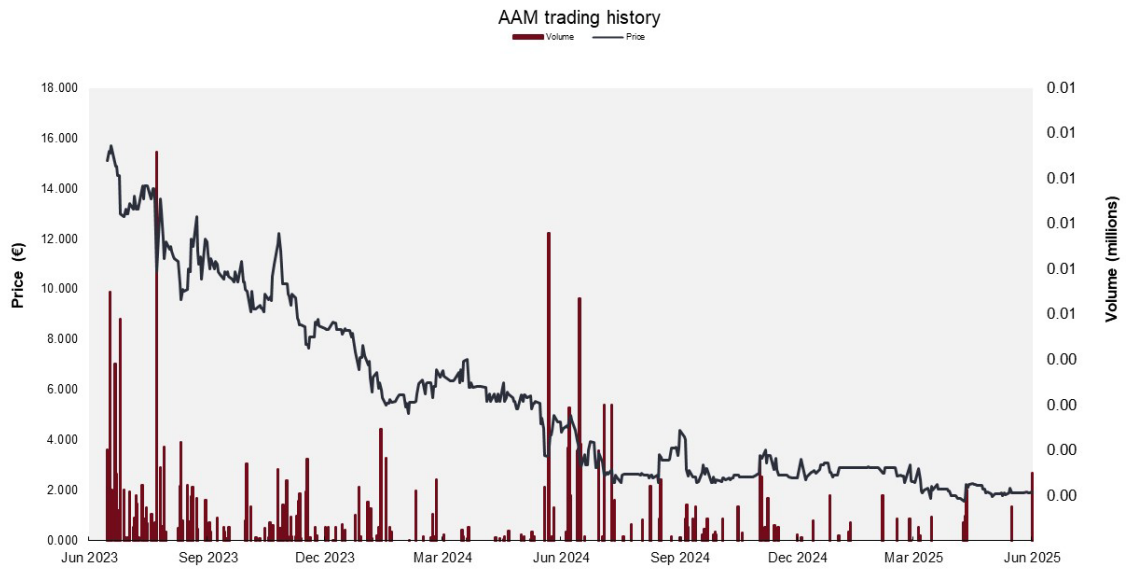
Figure 3. AAM Deutsche Boerse Trading History