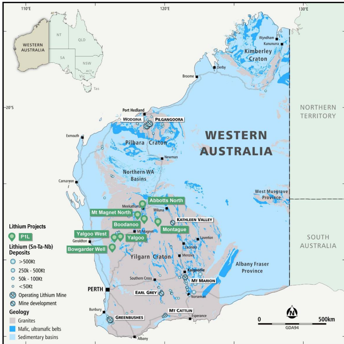
Figure 1: Location of main projects within Premier1 portfolio.

and follow up exploration was not completed by the Company due to competing priorities at the time and the changing emphasis towards lithium exploration.