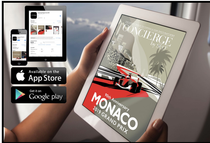
Concierge Monaco Grand Prix Magazine