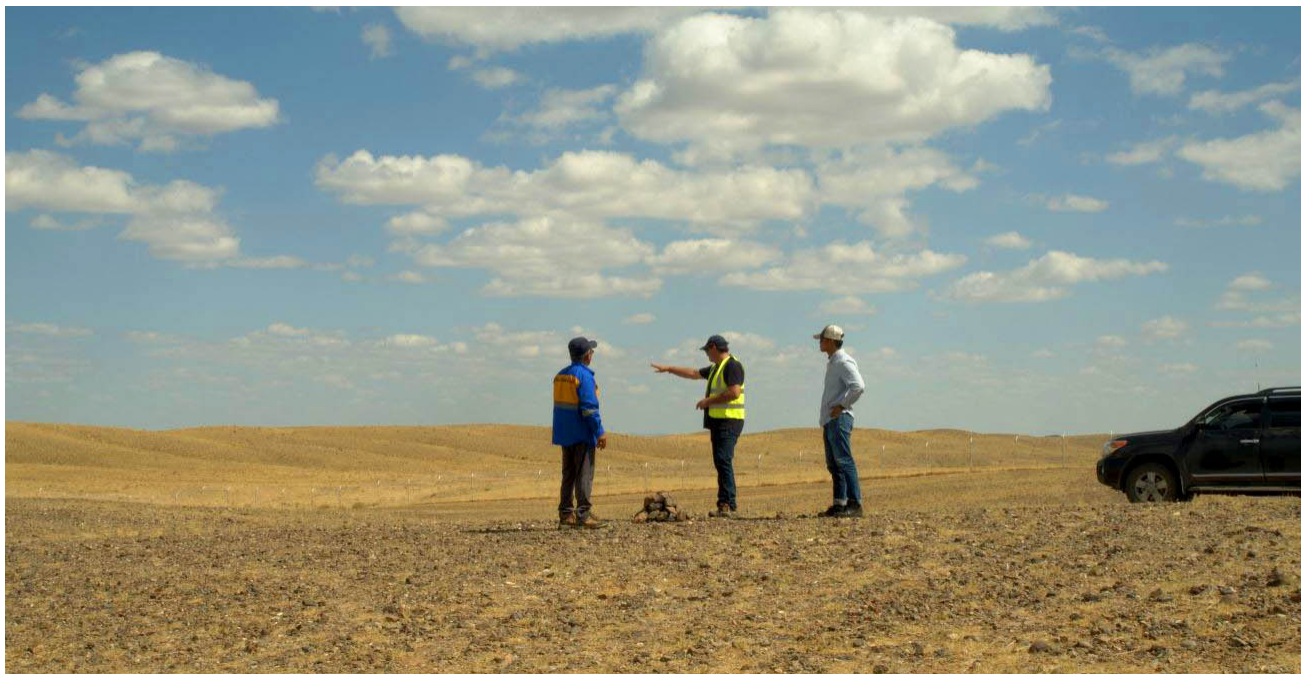
The Ugtaal – 1 well location showing typical South Gobi dry steppe geography