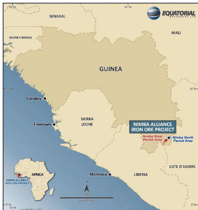
Figure 1 – Project Location