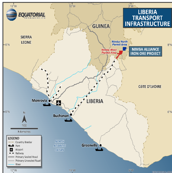
Figure 2 – Liberian Transport Corridor