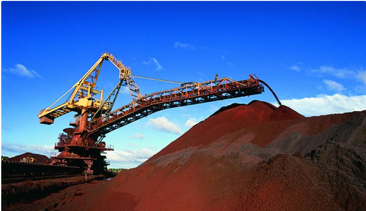
Vale's Ponta da Madeira iron ore terminal in Brazil.

Vale S.A. is one of the world's largest producers of iron ore and iron ore pellets, with an annual output exceeding 300 million tonnes. Vale employs approximately 125,000 people in over 30 countries. As a global mining powerhouse, Vale supplies premium-grade iron ore products tailored for blast furnace and direct reduction steelmaking, offering a range of fines, lump ore, and pellet feed that supports cleaner, more efficient steel production. Vale's vertically integrated operations include some of the world's most advanced mining complexes, such as Carajás in Brazil, which boasts high-grade reserves and low impurities. The company's infrastructure network spans over 2,000 kilometres of heavy-haul railways and multiple deep-water ports, enabling efficient large-scale exports to steelmakers worldwide.