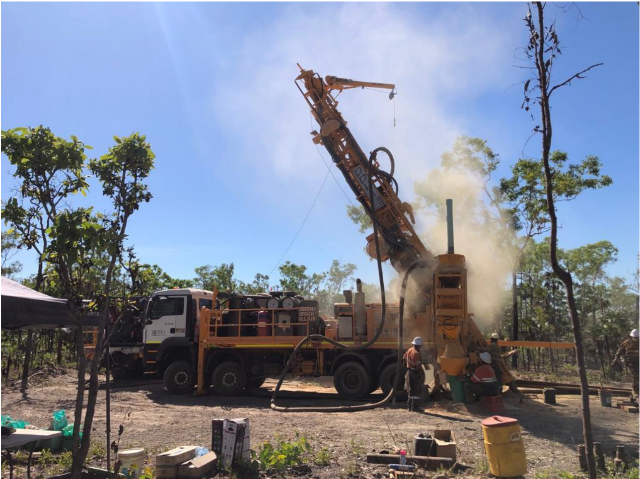
Figure 1: Dual RC/DD rig in operation at Perseverance Prospect, Kings Landing Area

The planned 5,000m drilling program is underway at the Kings Landing Area of the Bynoe Lithium Project. The program has been designed to follow encouraging historic drill results at the Perseverance Prospect and provide a first round of reconnaissance drill holes into the untested Jewellers, Jeweller's Extended and Jenny's pegmatite occurrences. Drilling at Perseverance by LPM during the 2022 field season confirmed spodumene mineralisation in fresh pegmatite (including 8.0m @ 0.54% \text{Li}_2\text{O} from 118m (BYPRC008); refer ASX announcement, 1 February 2023).