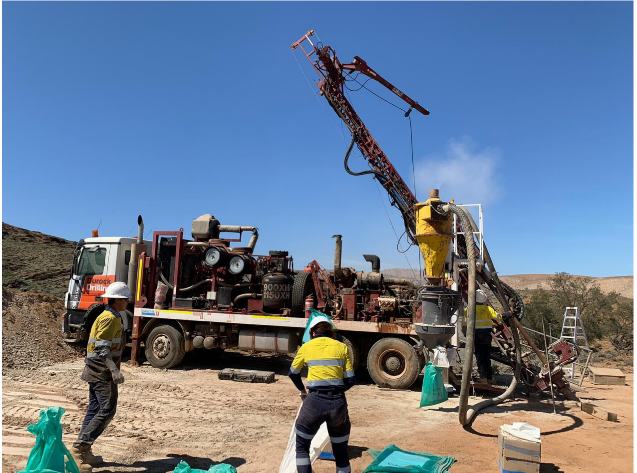
Figure 2: Aircore Drilling Across the Woolshed Workings

In addition to the Aircore drilling, the Company has also commenced auger drilling at the Jenkins prospect to test potential mineral anomalism at depths of 2-3m.