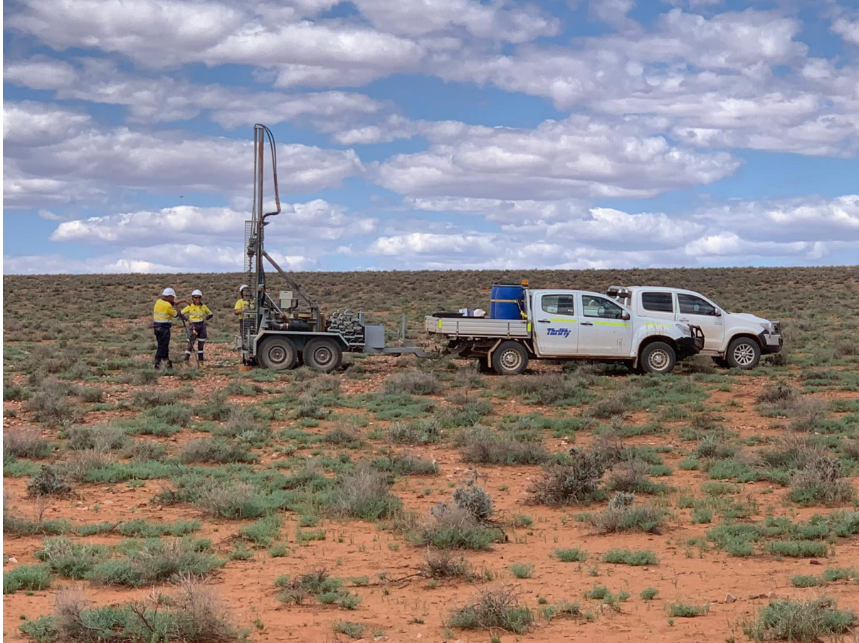
Figure 3: Auger Drilling at Jenkins South