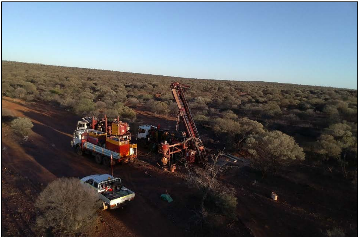
Fig. 1 Drilling underway at the Gold King project

Western Gold Resources (ASX: WGR) ("WGR" or "the Company") is pleased to announce that the 2022 Exploration drilling program at Gold Duke Project, has commenced (Fig. 1). Drilling at the Gold Duke Project is expected to take 6 weeks with first assay results due in early May 2022.