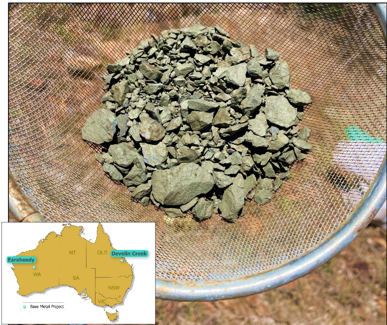
Figure 1- Massive Copper-Zinc Sulphide Drill Chips (ZSRC017 47 – 48m)