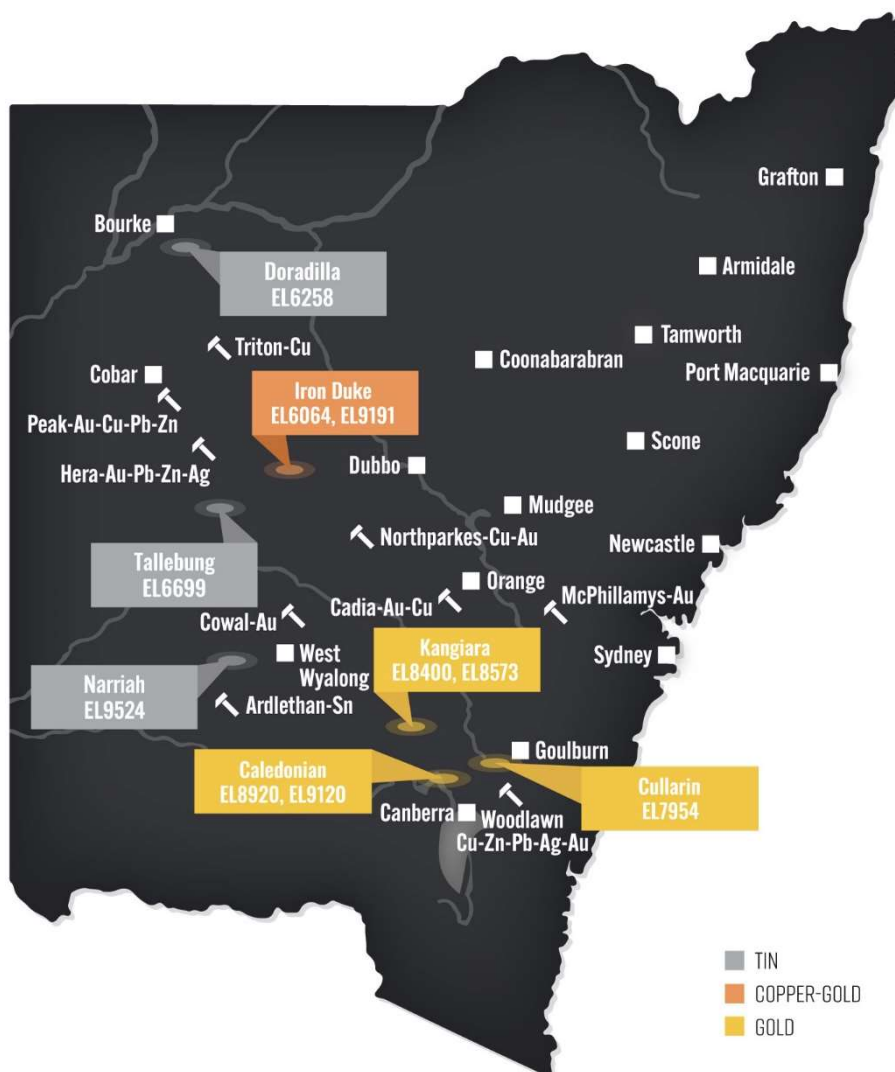
Figure 2: SKY Tenement Location Map

Highlight, 'McPhillamys-style' gold results from previous exploration include 36m @ 1.2 g/t Au from 0m to EOH in drillhole LM2 and 81m @ 0.87g/t Au in a costean on EL8920 at the Caledonian Project.