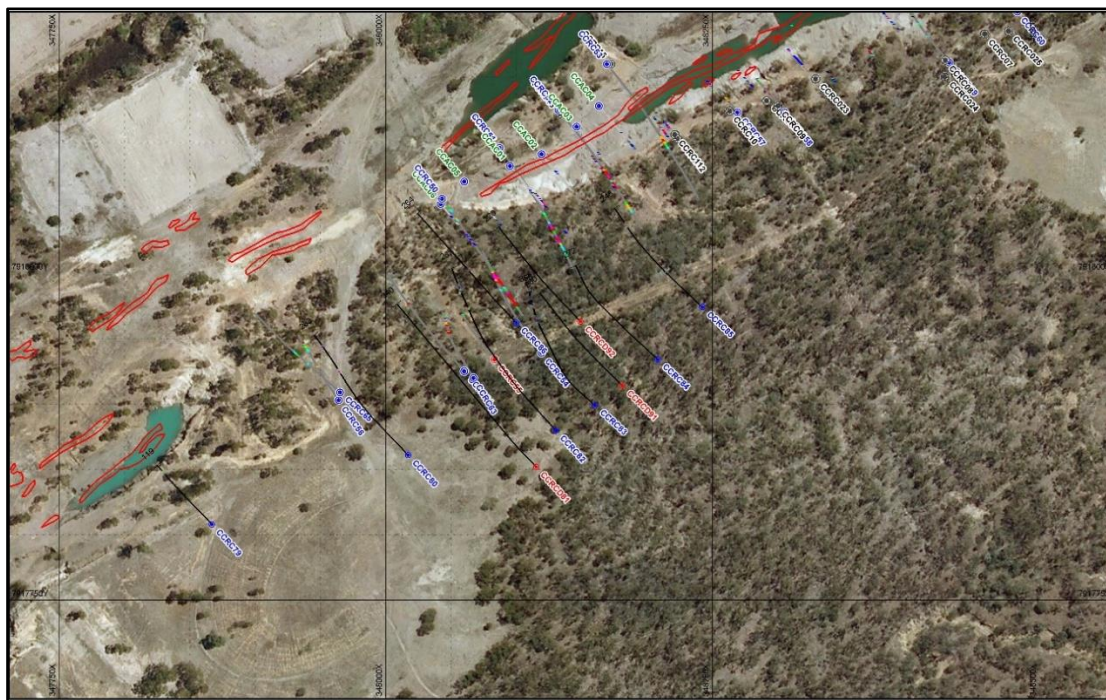
Figure One: Diamond Drilling Location Plan on aerial image

Once all results have been analysed by the laboratory and the results received by the Company, the initial JORC resource for Camel Creek will be completed.