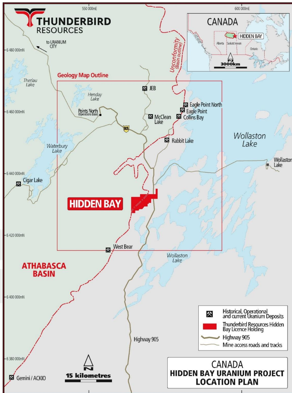
Figure 1. Location of Hidden Bay Uranium Project in the Athabasca Basin

Hidden Bay is located approximately 20km south of the historic Rabbit Lake Uranium mine, which was the longest running uranium mine in North America with over 41 years of mining, producing over 203 million pounds of uranium concentrate 1 . This part of the Athabasca Basin is highly endowed with several uranium deposits and producing mines within a 40km radius including Eagle Point, Collins Bay, Cigar Lake, Roughrider, and Horseshoe-Raven (see Figures 1 and 2). Despite its proximity to multiple uranium prospects and deposits only one hole has been drilled on the property in the last 35 years (see Figure 3).