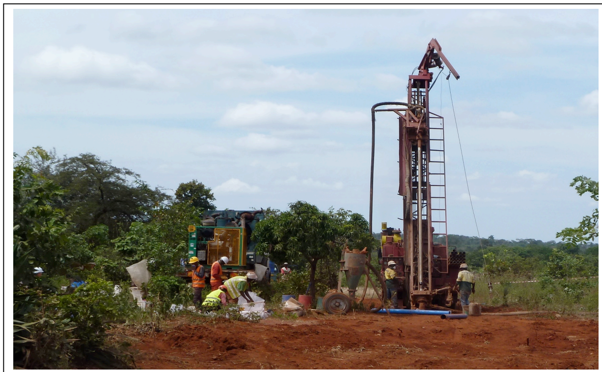
Drilling at Dalafuma – June 2016