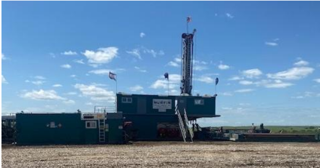
Figure 1: Murfin Rig 116 rigging up at McCoy1 well site.

an initial testing program planned to be after all the wells have been drilled and the subsurface data has been analysed.