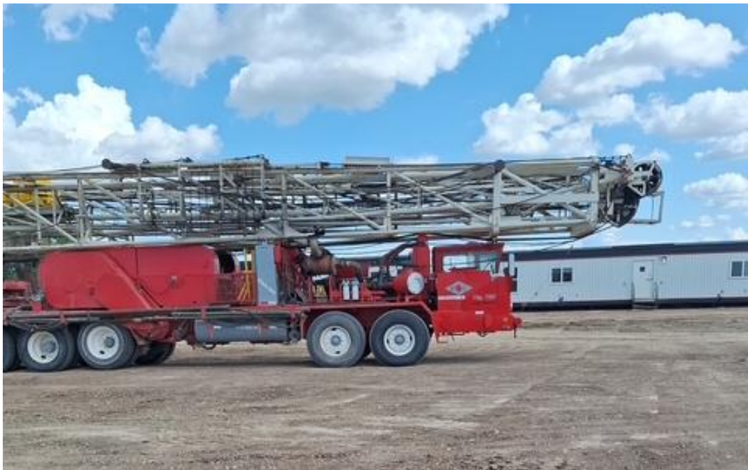
Figure 2: Workover rig arriving at Blythe 13-20 well site.

This announcement has been authorised for release by the Board of Directors.