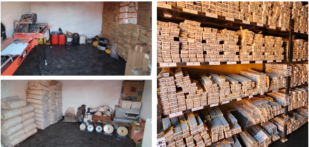
Figure 2: Geology stores and RC chip storage