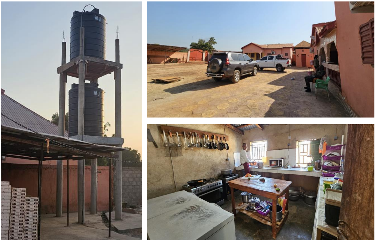
Figure 1: Niandankoro Camp