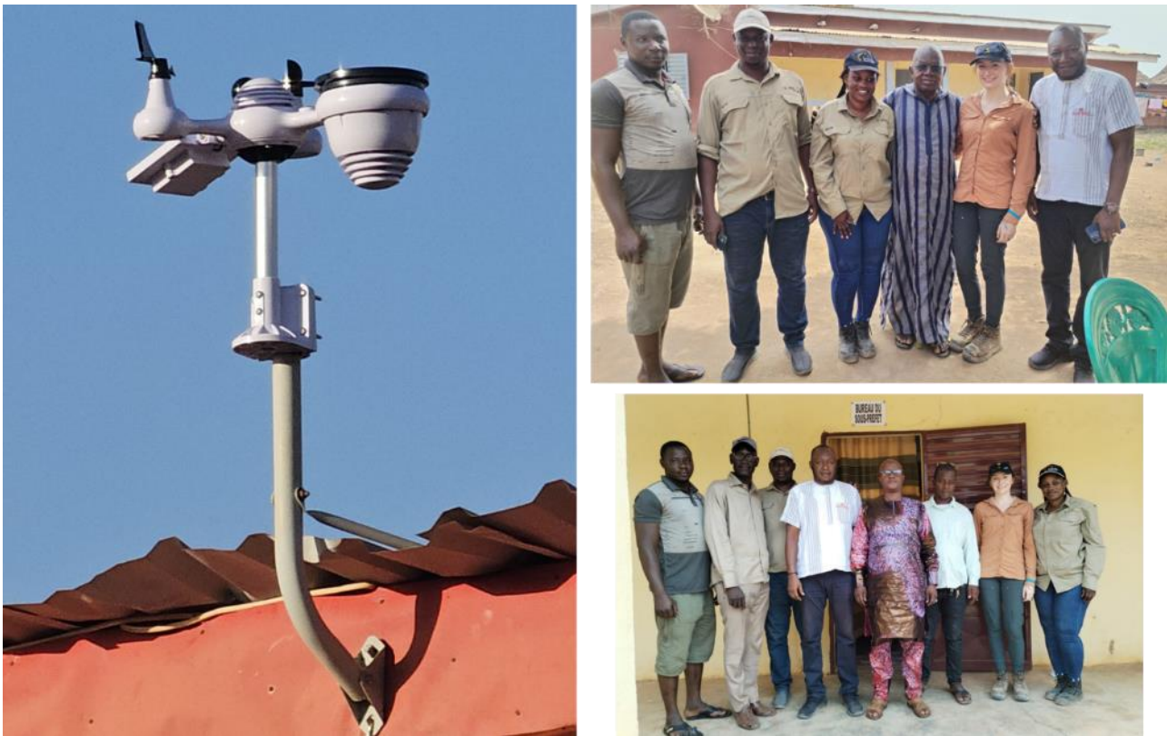
Figure 5: Weather station installed at Niandankoro Camp and meetings with local dignitaries and community leaders