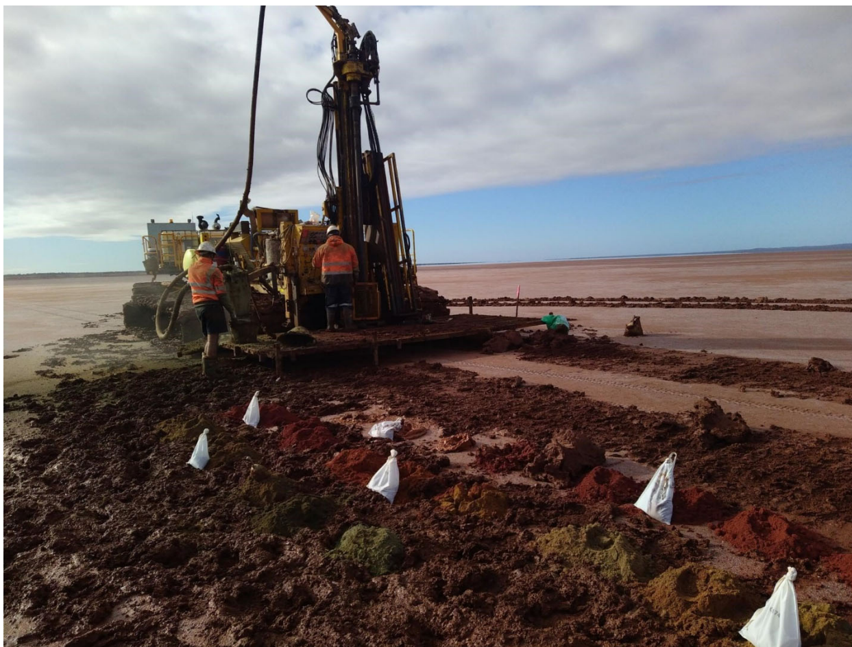
Photo 1: Lake AC drill rig over Lake Lefroy at Coogee West prospect.