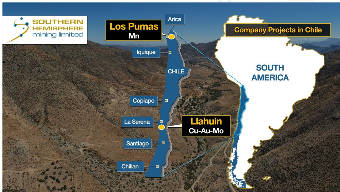
Figure 1: Location map of Southern Hemisphere's Projects in South America.

Southern Hemisphere Mining Limited ("Southern Hemisphere" or "the Company") (ASX: SUH, FWB: NK4) reports the quarterly activity for the period ended 30 June 2025.