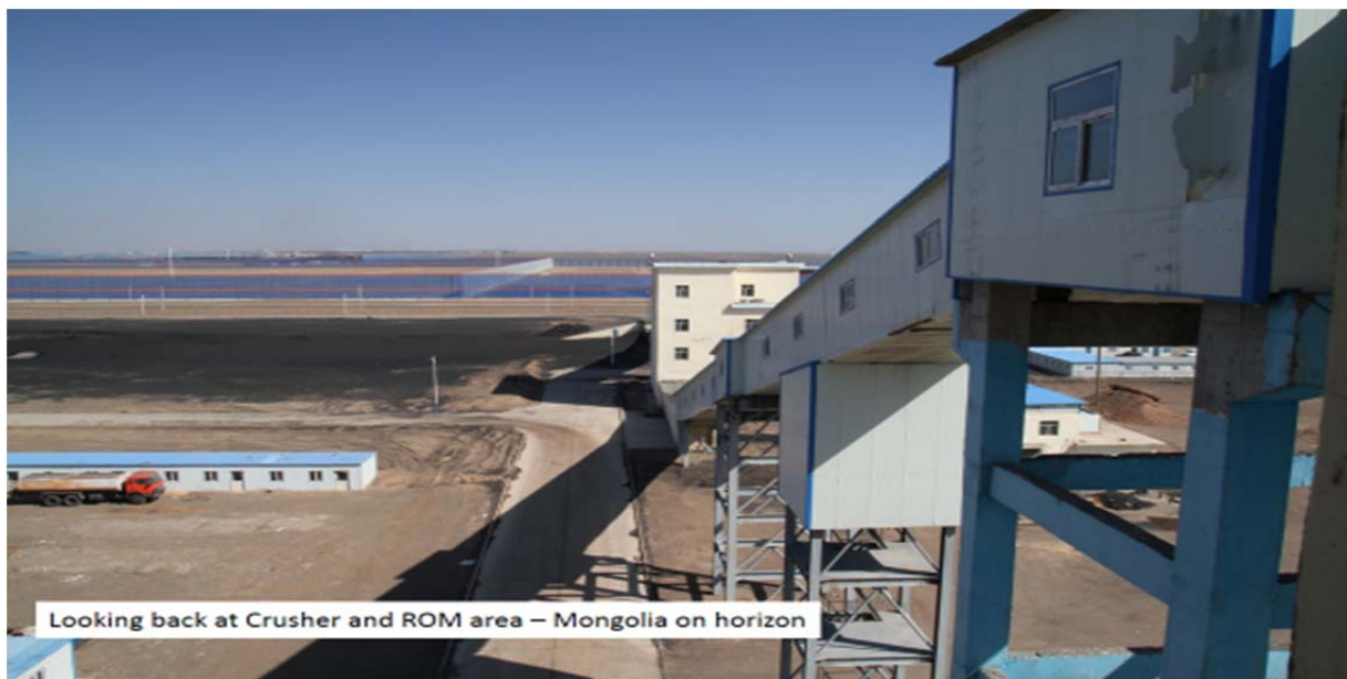
Figure 3 Looking back at washplant feed area