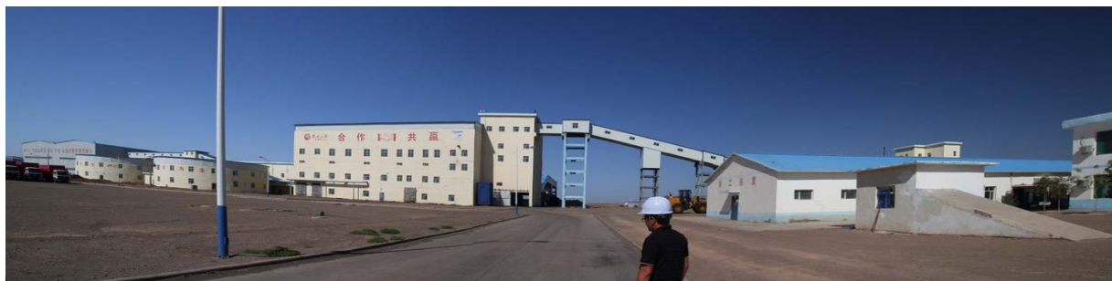
Figure 1 Zhongmeng washplant