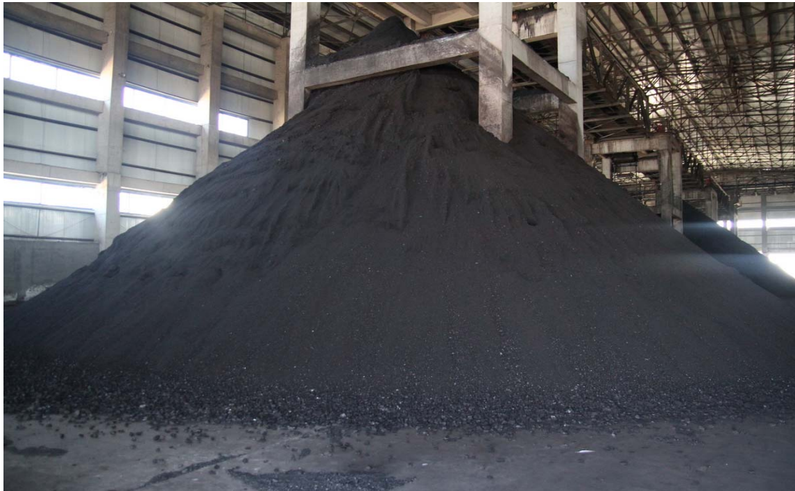
Figure 5 Lot 1 clean coal stockpile