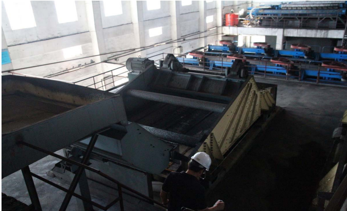
Figure 4 Jig (coarse coal separator) area with float cells in background