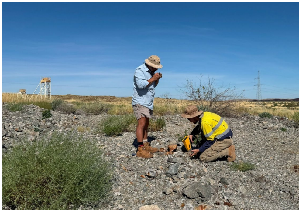
Figure 2 – West Coast Silver geologists on site at Elizabeth Hill. Geologists in the foreground analysing utilising pXRF technology and Elizabeth Hill headframes in the background.

In addition to the planned drilling program, a regional soil sampling program has been recently completed with samples currently at the analytical laboratory for assay.