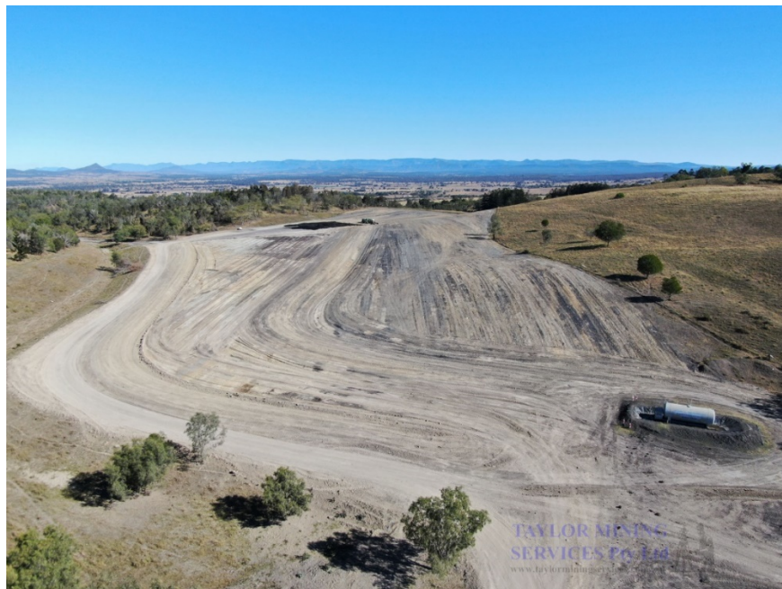
Oakleigh East showing ongoing rehabilitation and capping of a tailings dam area. Images taken from the north-east

Oakleigh East rehabilitation activities have continued with the capping of a remnant tailings dam completed and an initiation of works to restore the cut/fill balance in line with other areas of the site.