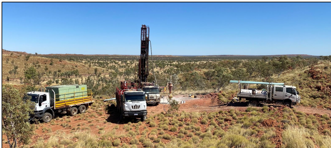
Figure 1: Drill crew and support vehicles drilling at the Solo Prospect

The Phase II drilling program at the Mt Mansbridge Project commenced on the 14 th of July 2022 and was successfully completed at the start of August 2022.