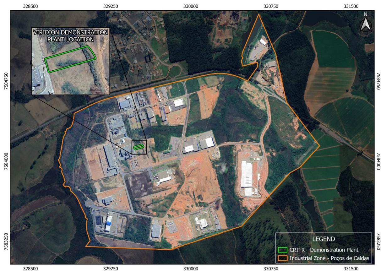
Figure 2: Satellite image of the Industrial Zone in Poços de Caldas, highlighting the area designated for developing technology centres in partnership with the private sector.

years, generate local jobs across production and engineering, contribute R$100,000 (~US$16,667) to municipal programs, and provide annual compliance reports to the Economic Development Secretariat.