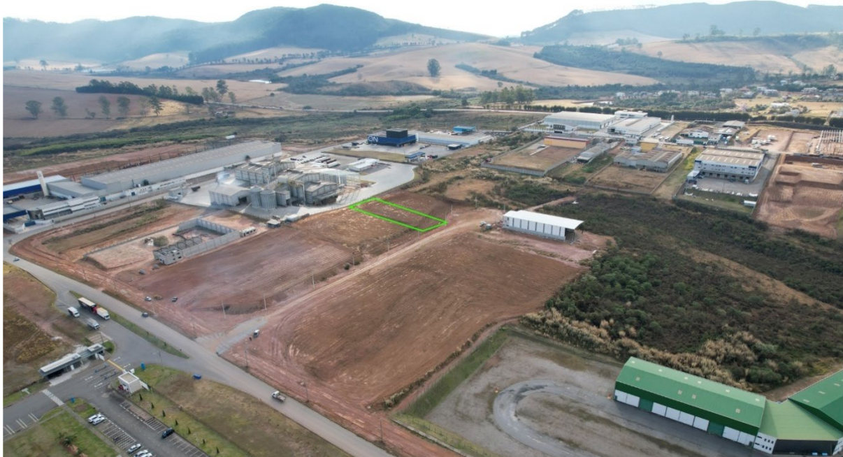
Figure 1: Aerial photograph of the Poços de Caldas Industrial Zone highlighting the Viridion site (outlined in green), surrounding industrial facilities, main access roads, and infrastructure.

The CRITR will be located in the Poços de Caldas industrial zone, nearby to the Colossus Northern Concessions resource. The CRITR will be developed on a 2,071m 2 site granted by the municipal government under Law No. 6/2025 and it will host Latin America's first demonstration-scale facility for rare earth separation and magnet recycling. This industrial zone benefits from robust municipal infrastructure, including paved access roads, reliable utility connections and proximity to key logistics corridors supporting efficient supply chain integration.