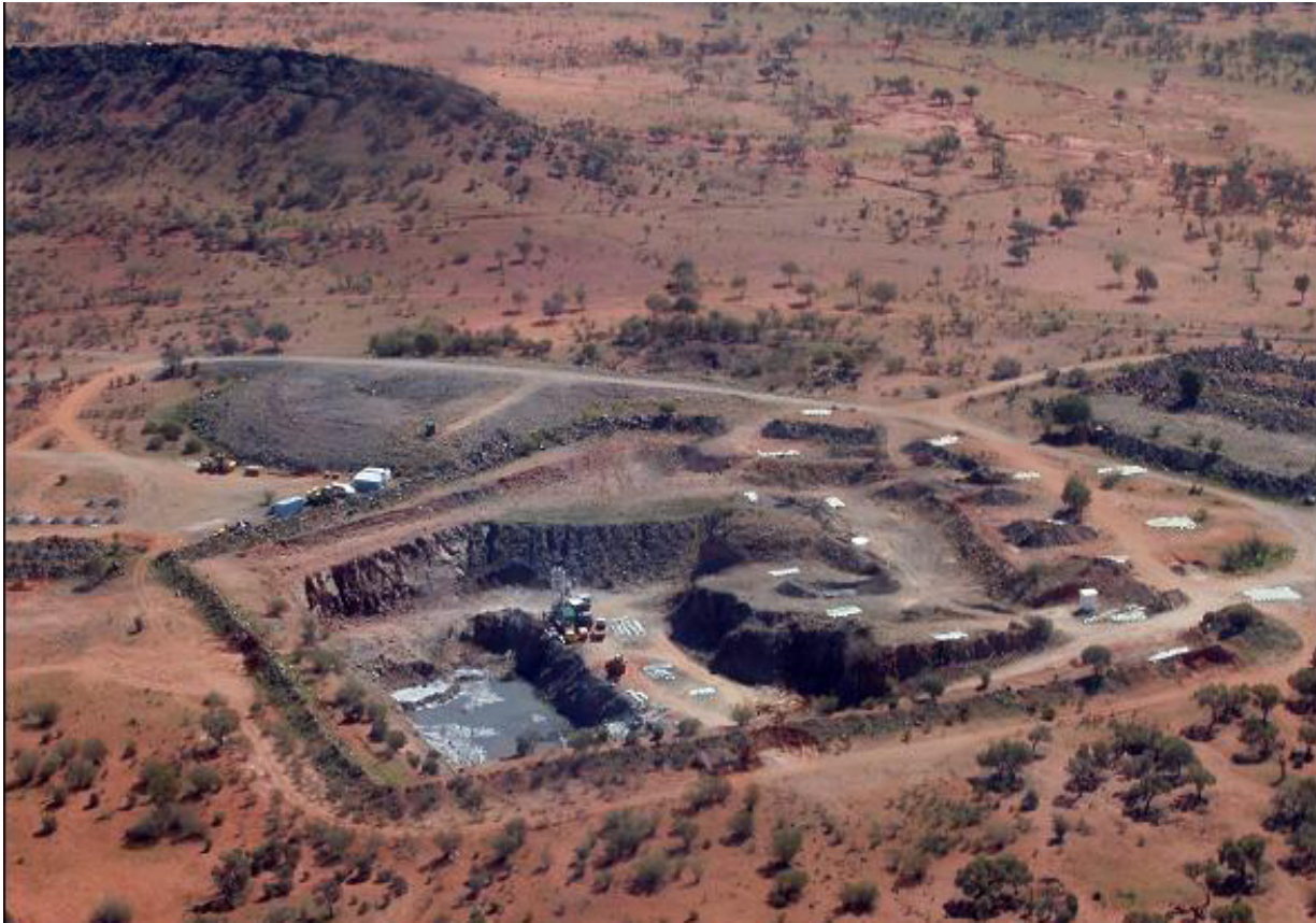
Figure 2: Molyhil Open Pit