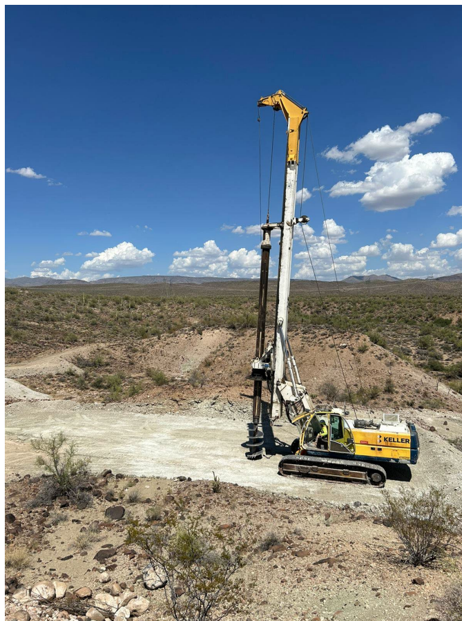
Figure 1 – Bulk Sampling at the Big Sandy Lithium Project, Arizona, USA.

The Big Sandy lithium project is located on interstate I93 between Phoenix and Las Vegas and is comprised of 331 Bureau of Land Management (BLM) claims in Arizona, covering approximately 25 km 2 (Figure 2).