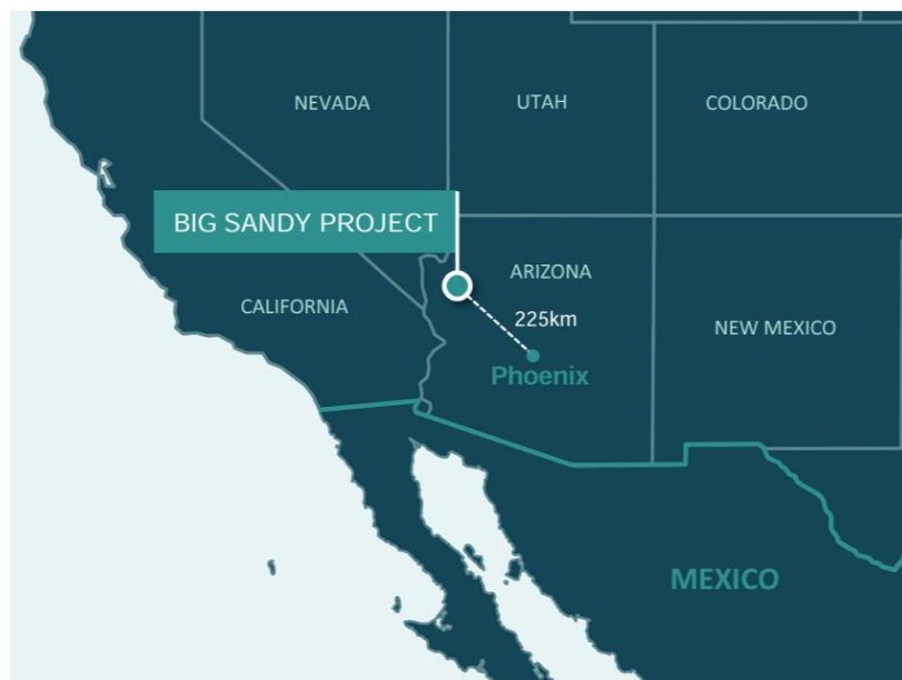
Figure 2 – Location of the Big Sandy Lithium Project, Arizona, USA.