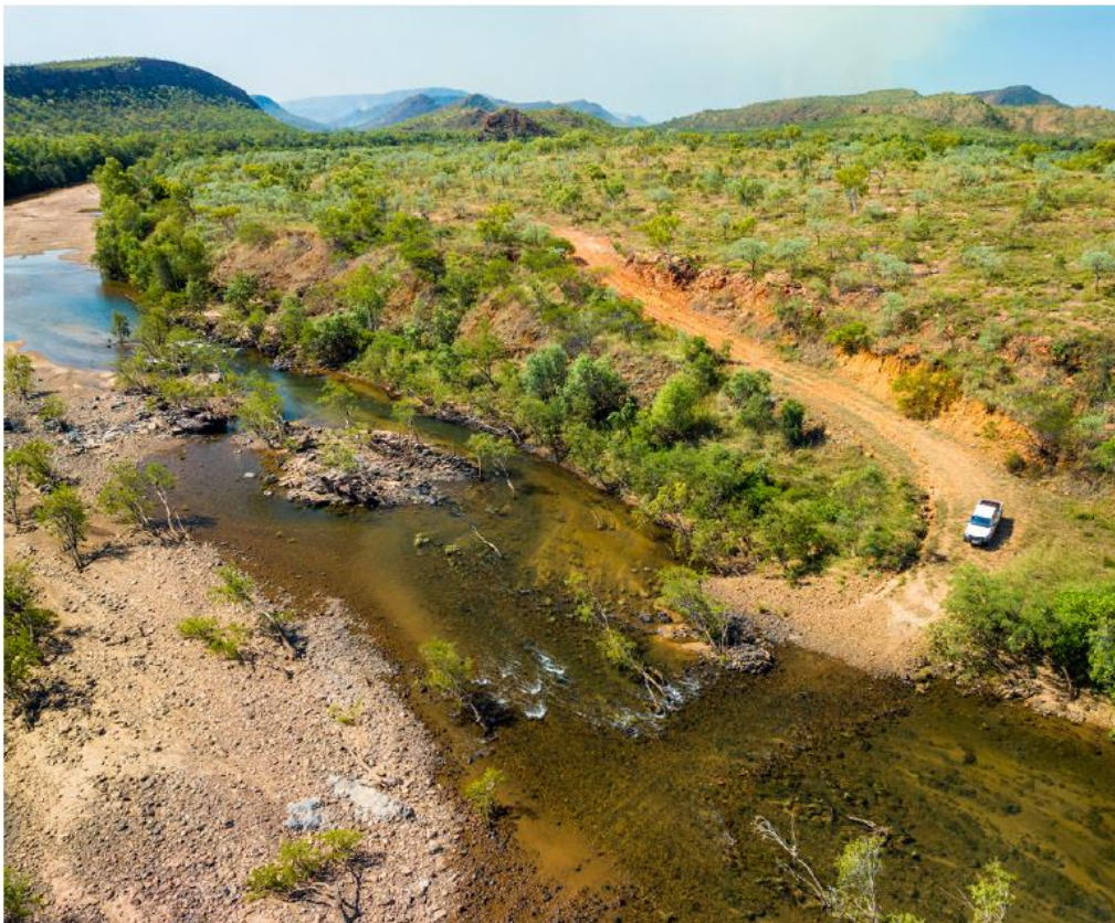
Figure 1: Photo of the existing historical Speewah access tracks at the Dunham River crossing

Access to the Project is currently via 47km of historical single lane natural terrain tracks from Doon Doon, a small community and roadhouse situated adjacent to the Great Northern Highway. Tivan, via its wholly owned subsidiary Speewah Mining Pty Ltd (“SMPL”), holds three granted Miscellaneous Licences which cover the majority of these existing access tracks, and has an agreement in place with Glen Hill Pastoral Aboriginal Corporation (GHPAC) to access parts which are not included (see ASX announcement of 31 May 2024).