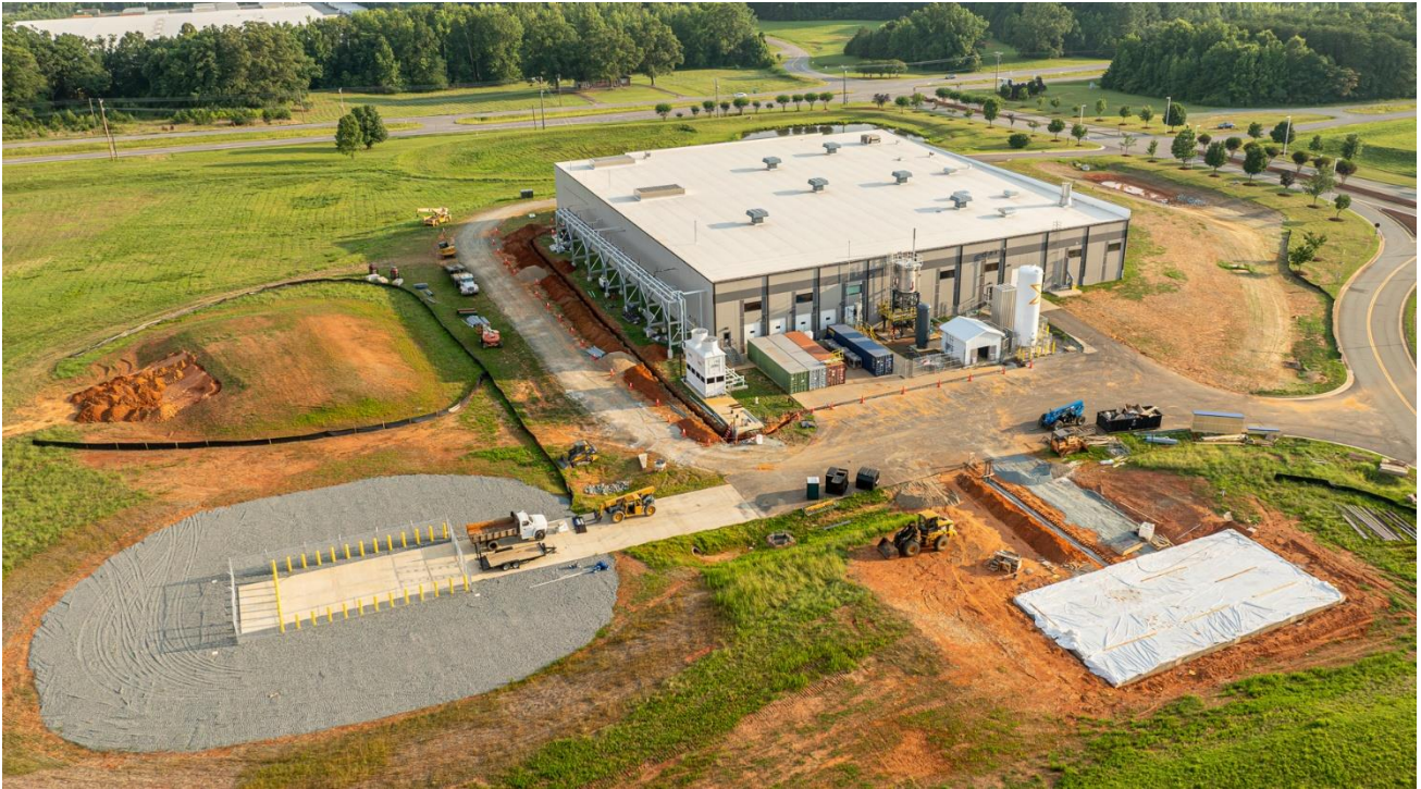
Figure 1: Titanium Production Facility ancillary facilities complete

Successful commissioning of the Titanium Manufacturing Campus in Virginia, with all major scrap-to-forged titanium manufacturing equipment now online and proven to meet operational capacity including the jet mill (scrap size reduction), HAMR furnace (deoxygenation), leaching room operations (post-deoxygenation processing) and all external ancillary facilities.