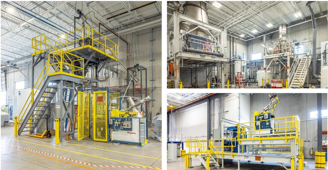
Figure 2 (clockwise from LHS): Jet mill, leaching room, scrap loading machine installed and commissioned