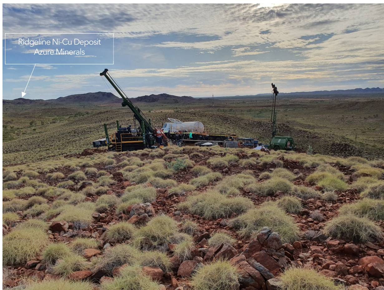
Figure 1. Diamond drilling at Andover West

As previously discussed in the announcement released 9 December 2022 1 , the Company identified three priority targets, which are the subject of the Andover West maiden drilling campaign.