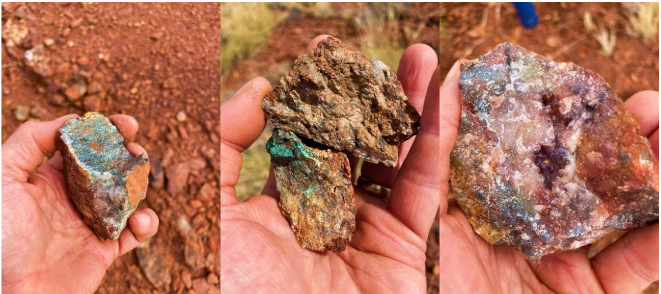
Figure 3 – Malachite enriched quartz vein (left), brecciated vein with malachite (centre) & hematite alteration in quartz vein (right), located at Pokali South area.