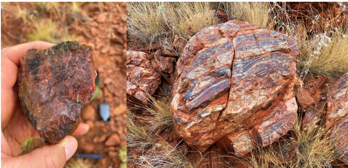
Figure 4 – Silica-hematite altered rock (left) & laminated silica-hematite-magnetite altered quartz vein/chert (right) located east of the new 'Jewel' target.