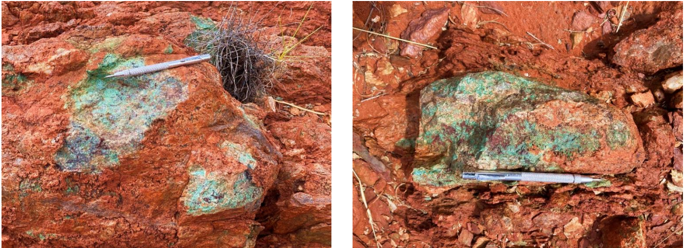
Figure 2 – Malachite (copper oxide) enriched & brecciated quartz veining from Pokali East area.