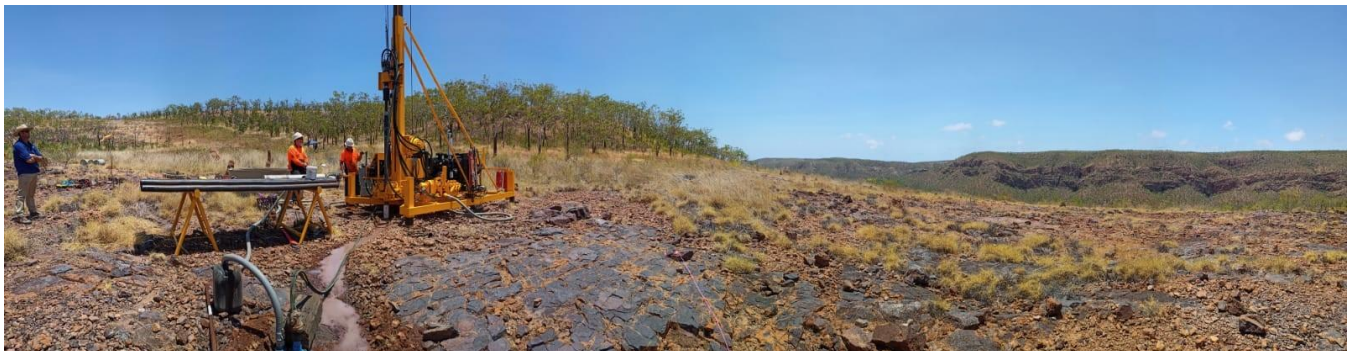
Figure 1. Harmec Drilling heli-portable diamond drill rig set up and drilling at drill hole YMP002D - looking west.

Post reporting period the Programme of Works was approved allowing for the commencement of the maiden Yampi Iron Ore Drill Program. Following this approval, the drilling contractor, Harmec Drilling mobilised to the staging area. Subsequently, following a successful lift, without any incidents the heli-portable diamond drill rig commenced drilling in the week commencing 18 October 2021.